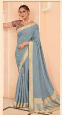
• 78716 •