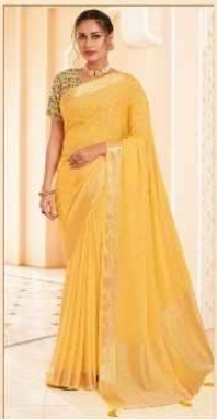
• 78709 •