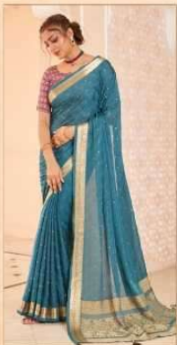
• 78708 •