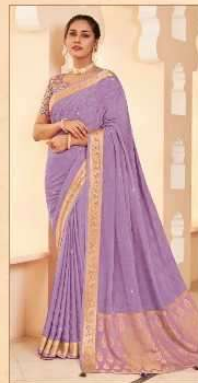
• 78715 •