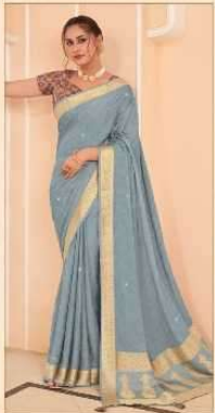
• 78716 •