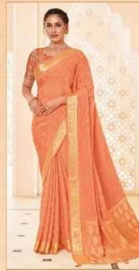
• 78711 •