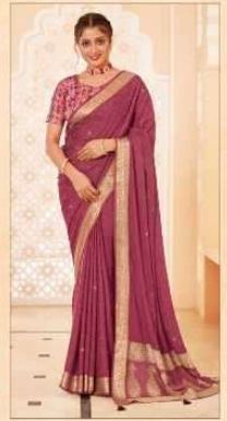
• 78713 •