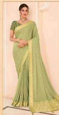
• 78714 •