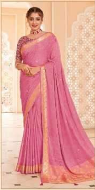
• 78707 •