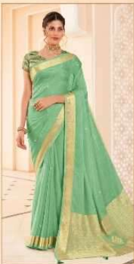
• 78710 •