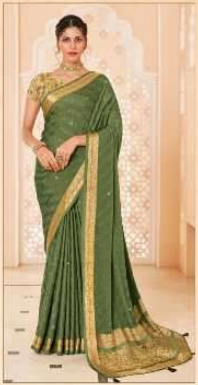
• 78706 •