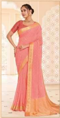
• 78705 •