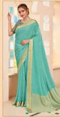
• 78712 •