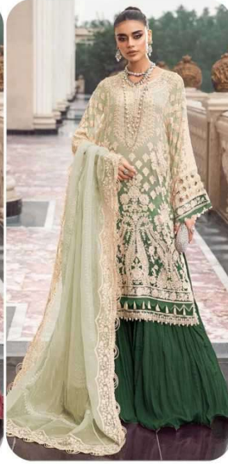
D.No | 237-C