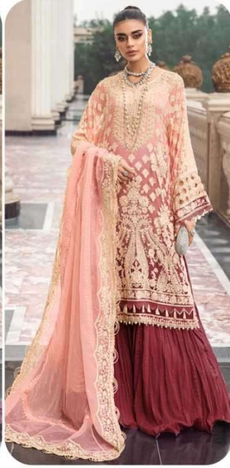
D.No | 237-B