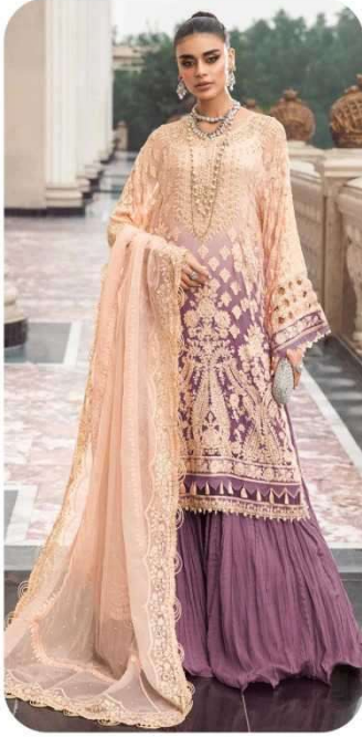
D.No | 237-A