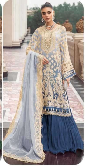
D.No | 237-D