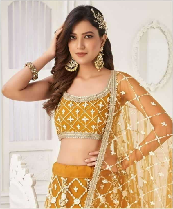
GO forth LE FABULOUS! 2128