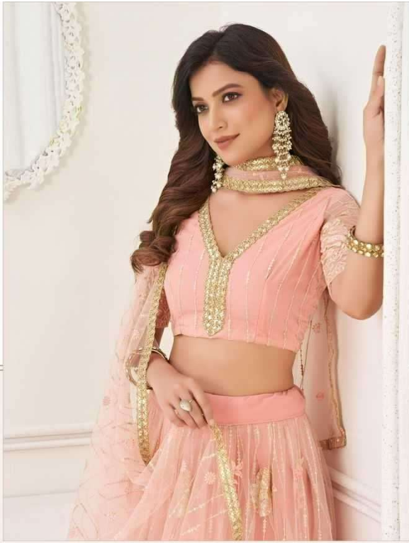
LOVE YOUR STYLE 2131