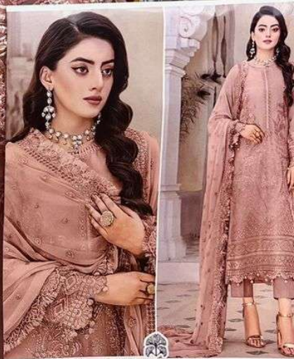
ZAHA D.No.10232-E TOP Organza with Embroid (Cut-2.5 Mtr.) DUPAT Dull santoon (Cut-4.20 Mtr.)