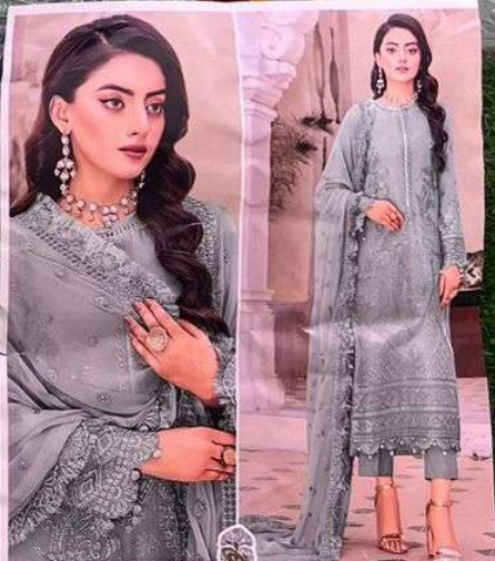
Z D.No.102 TOP Organza with Embroidery (Cut-2.5 Mtr) BOT DUPATTA with (Cut-2.5 Mtr)