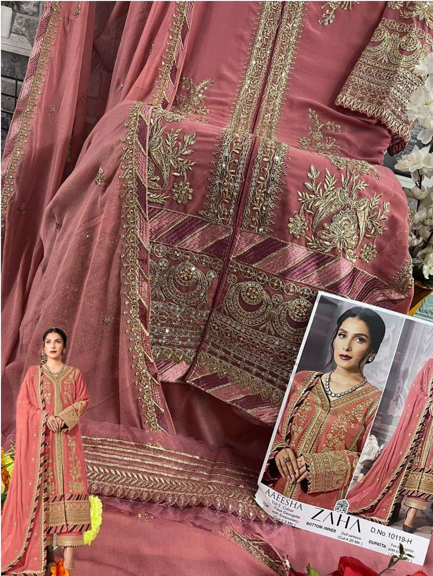
AAEESHA Vol-2 Colour Faux Georgette with Embroidery (Cut-2.5 Mr.) TOP ZAHA BOTTOM-INNER Dull santoon (Cut-4.20 Mr.) DUPATTA Faux Georgette with Embroidery (Cut-2.5 Mr.) D.No. 10119-H