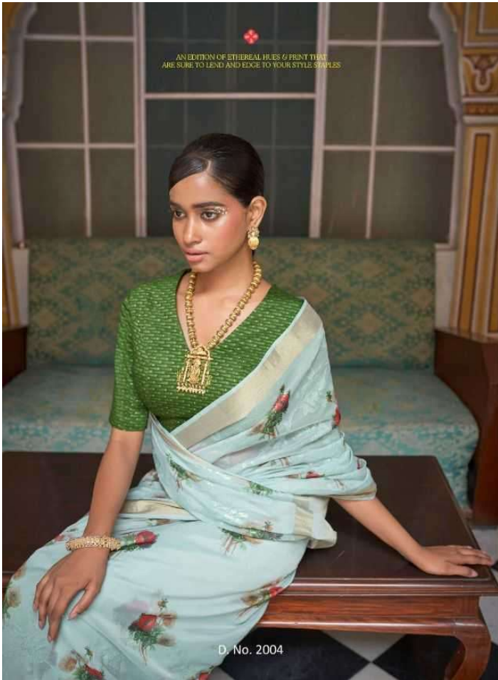
D. No. 2004

AN EDITION OF ETHERIAL HUES & FRAY THAT ARE SURE TO LEND AND EDGE TO YOUR STYLE STAPLES