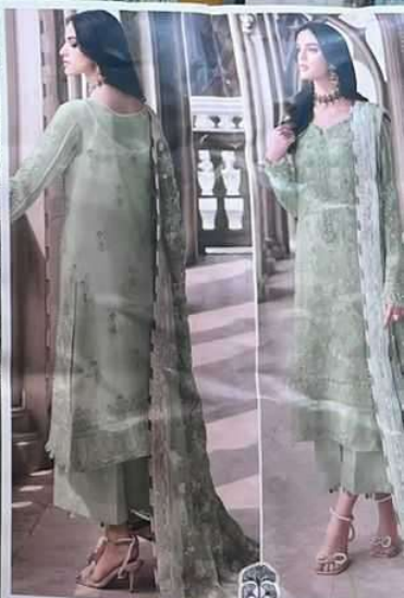
GULAAL HEAVY WITH GEORGETTE Flax Georgette with Embroidery (CA-2-5 Mtr) ZAHARA DANCE BOTTLE