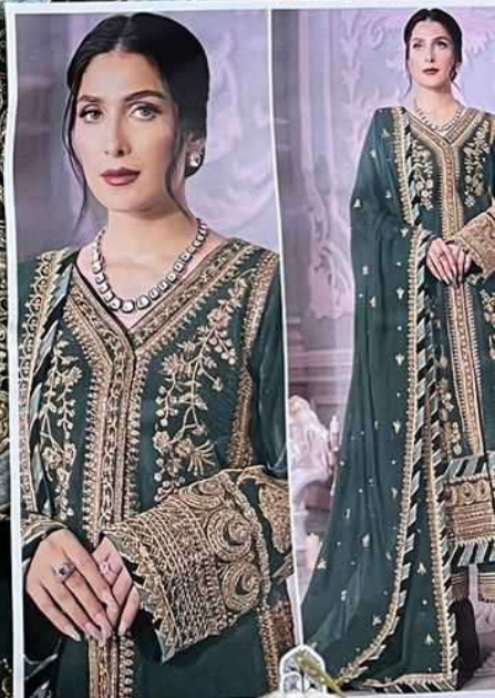
AAEESHA Vol-2 Colour Faux Georgette with Embroidery (Cut-2.5 Mr.) TOP 801 D.No. 10 DUPATTA