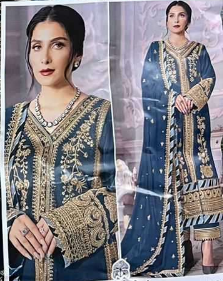
AAEESHA Vol-2 Colour Faux Georgette with Embroidery (Cut-2.5 Mtr.) ZAHA D.No.10119-S BOTTOM-INNER Dull lankton (Cut-4.20 Mtr.)