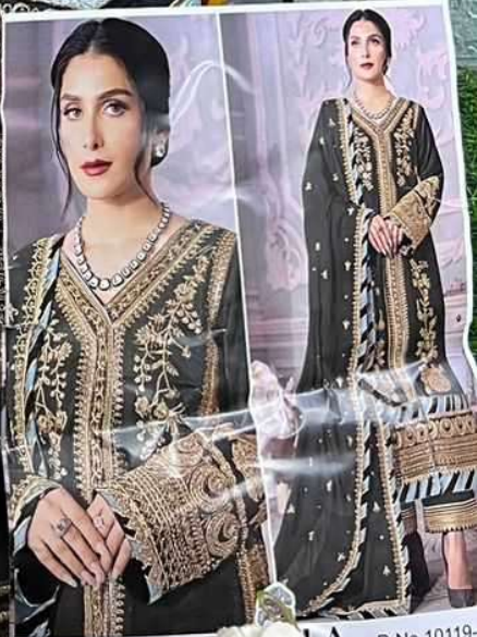
AAEESHA Vol-2 Colour TOP Faux Georgette with Embroidery (Cut-2.5 Mtr ) D.No.10119- DUPATTA For Georgette with Embroidery (Cut-2.5 Mtr )