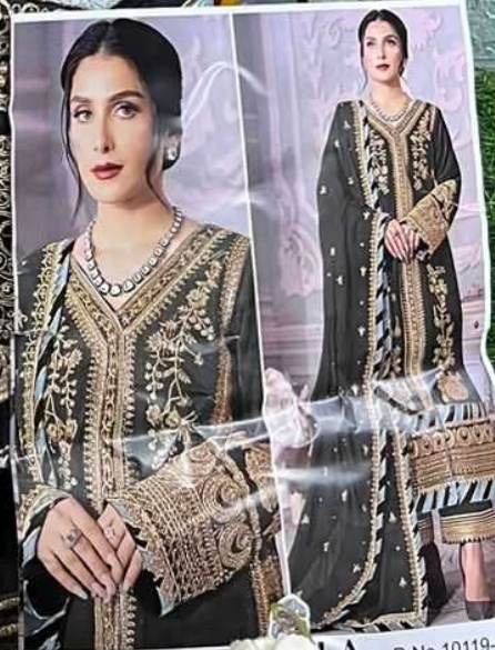
AAEESHA Vol-2 Colour TOP Faux Georgette with Embroidery (Cut-2.5 Mtr ) DUPATTA with Embroidery (Cut-2.5 Mtr ) D.No.10119- For Geo with Emb ( Cut-