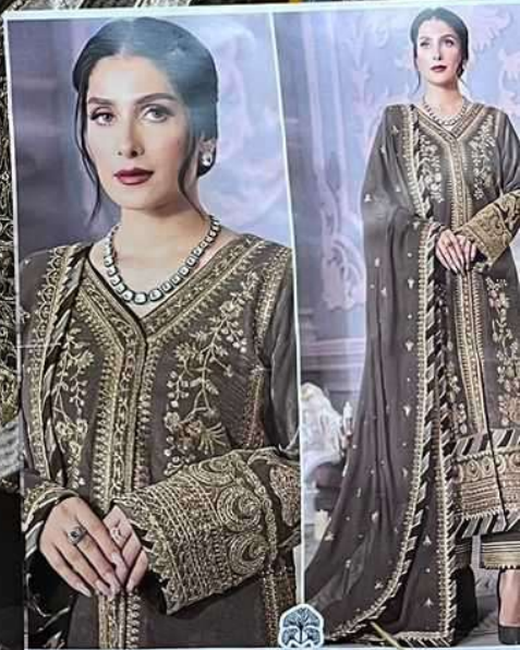
AAESHA Vol-2 Colour: Faux Georgette with Embroidery (Cul-2 & Mtr) ZAHARA No. 10119 TOP BOTTOM-INNER