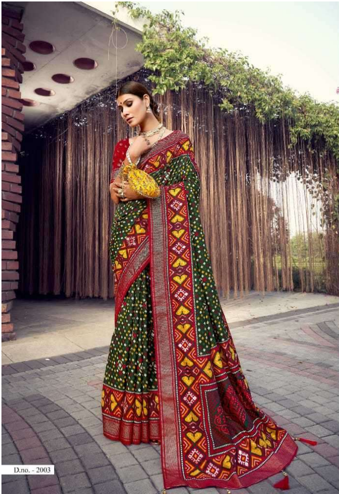
D.no. - 2003