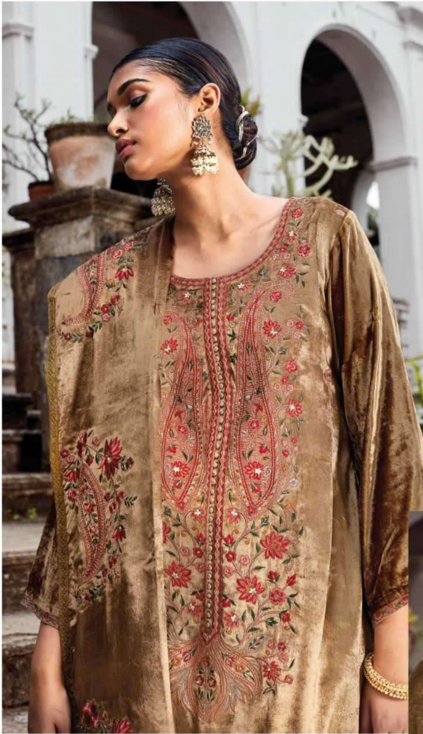
Ganga Fashions presents Mrunal Ethnic wear that can be donned on any auspicious festival, making your look graceful. Timeless designs, sewn with intricacy, celebrating the glory of celebrations.