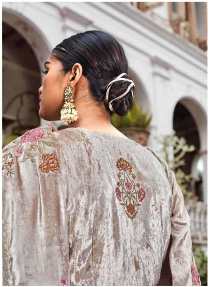
Ganga Fashions presents Mrunal Ethnic wear that can be donned on any auspicious festival, making your look graceful. Timeless designs, sewn with intricacy, celebrating the glory of celebrations.