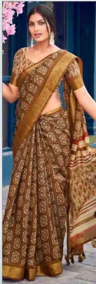
D.NO - 73006