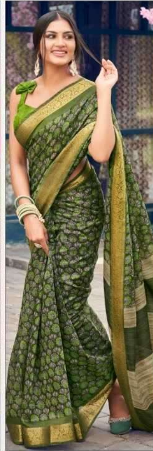
D.NO - 73003