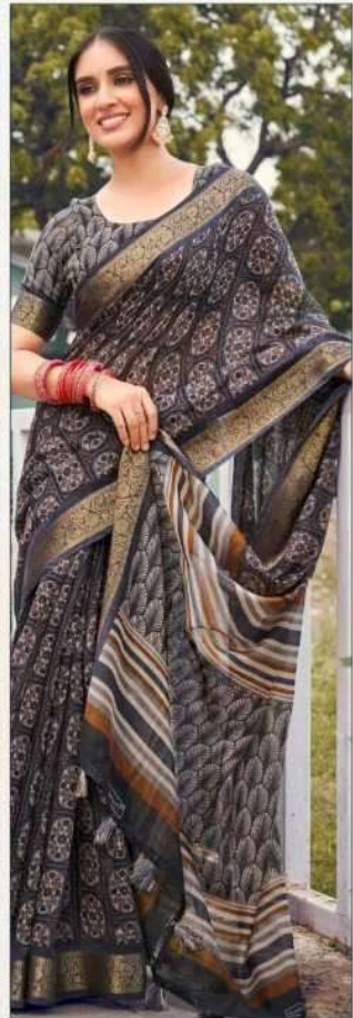
D.NO - 73004