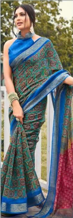
D.NO - 73001