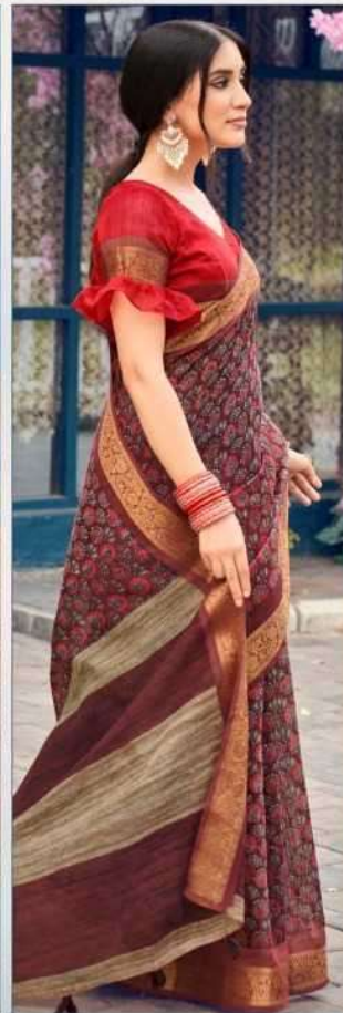
D.NO - 73007