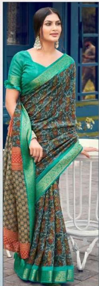
D.NO - 73008