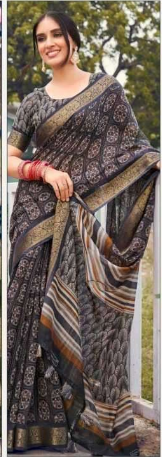
D.NO - 73004