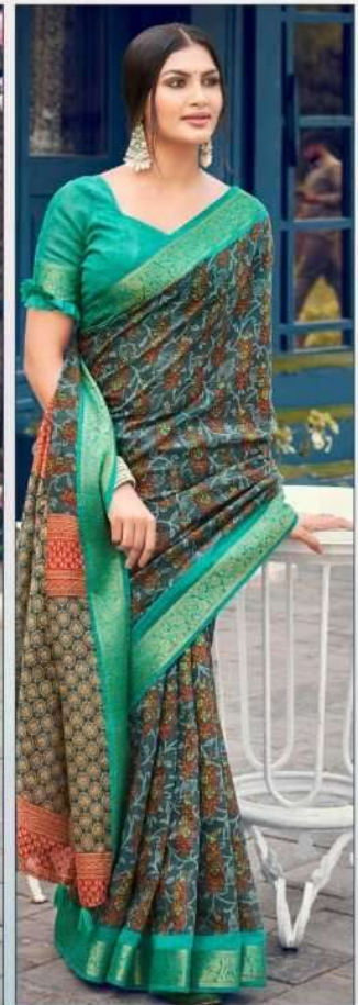
D.NO - 73008