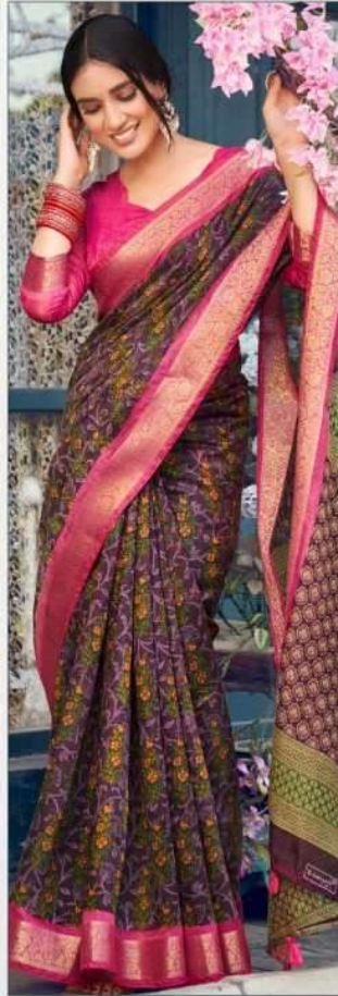
D.NO - 73002