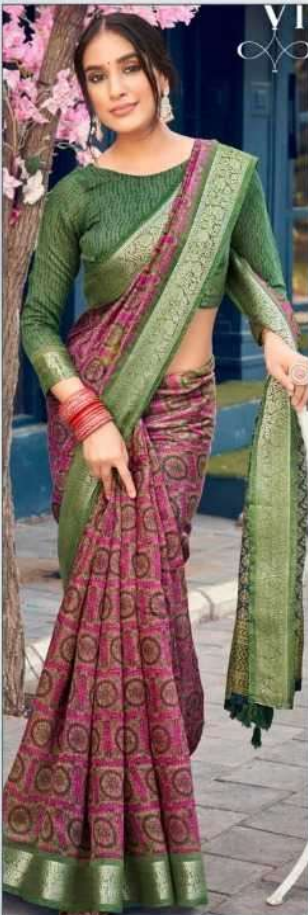
D.NO - 73005