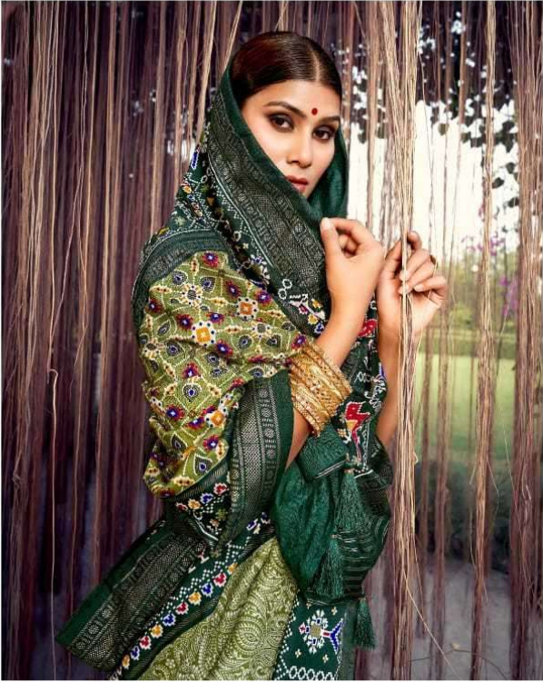
D.no. - 3001