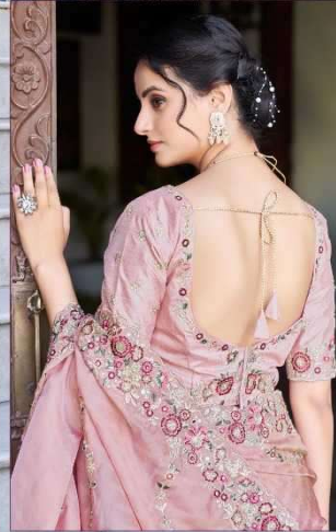
D.No.10009 Fabric Goldie Laheriya