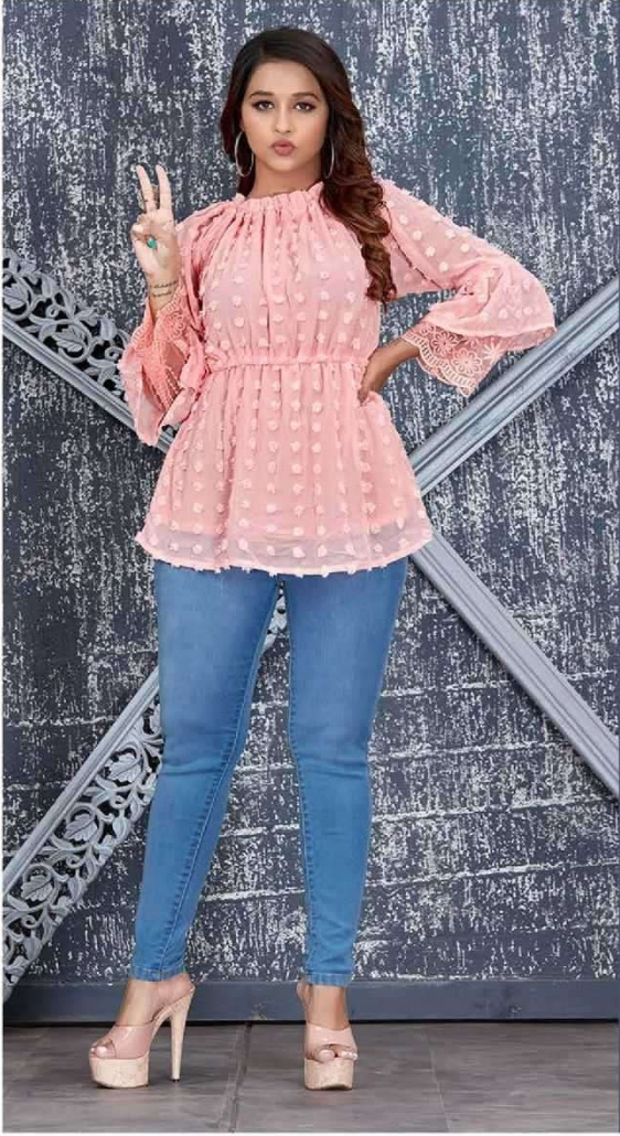
Heritage fabrics with intricate embroideries & ethereal sheer overlays for the modern woman.