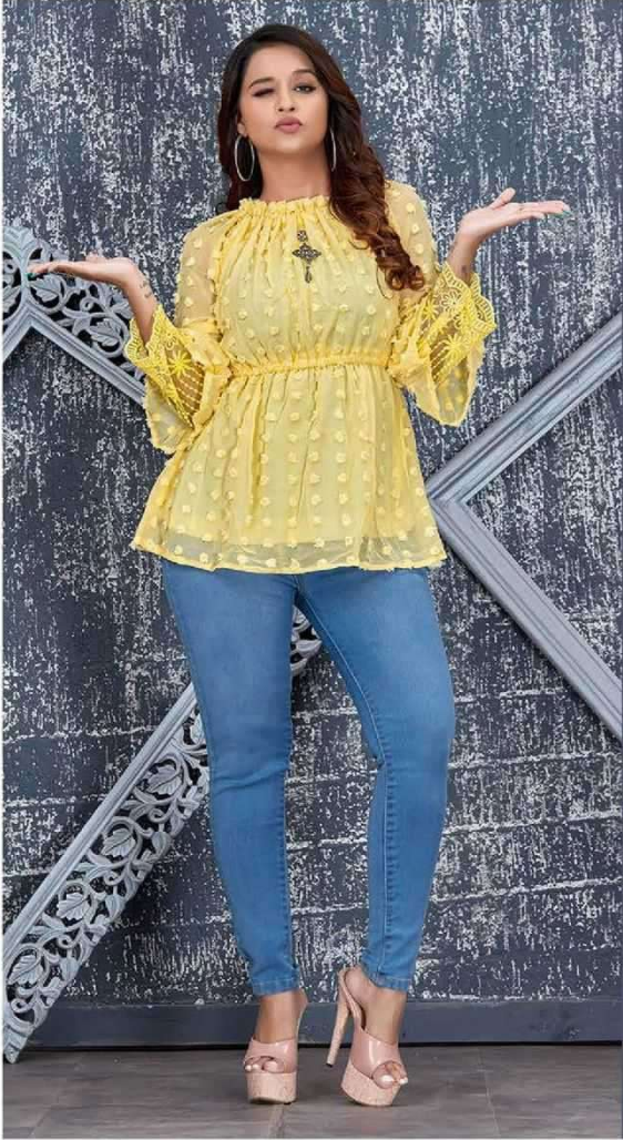
They have scoured the world for the most eye-catching garment deck them-selves in