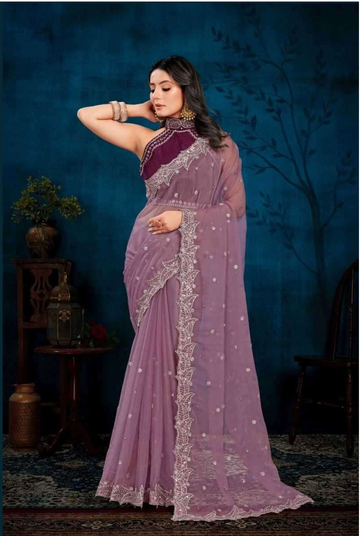
10023 SASSY CHIFFON