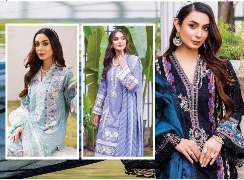
ADAN LIBAS CHIKANKARI - 14