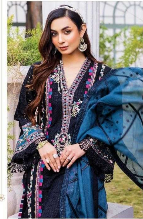
P - 4002