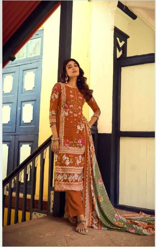
Fabulous vibrant tones to give any look an adrenaline rush