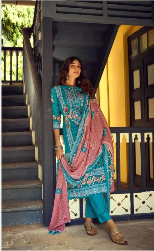
Simplicity a current trend that you sport with a personal take