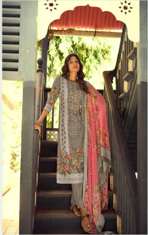
Fabulous vibrant tones to give any look an adrenaline rush