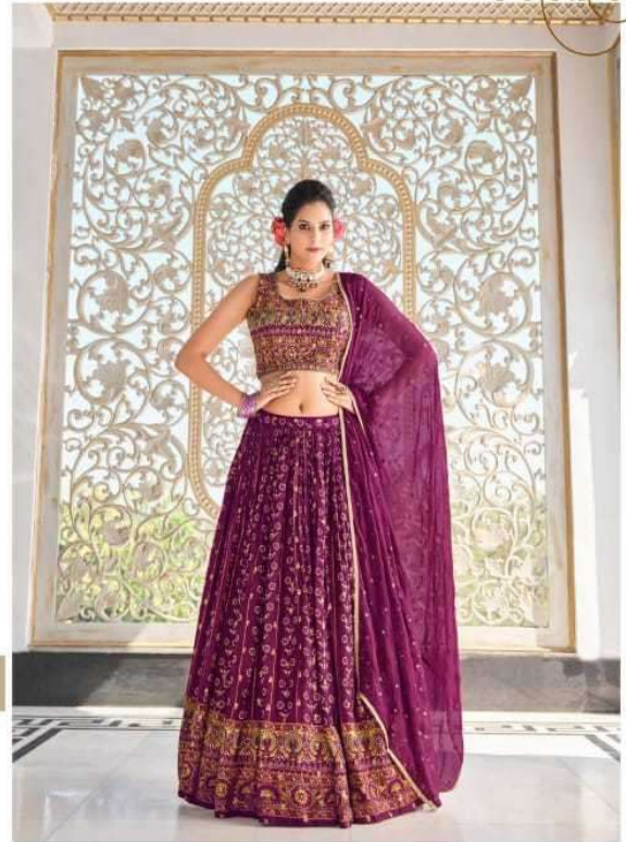
For elegance and class 3003