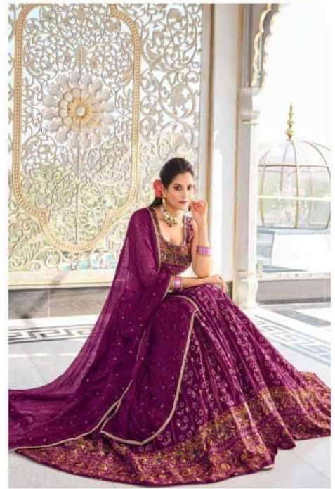
For elegance and class

Look is not something that existed in dress only fashion is in the sky, in the street, fashion has to do with ideas, the way we live what is happening.