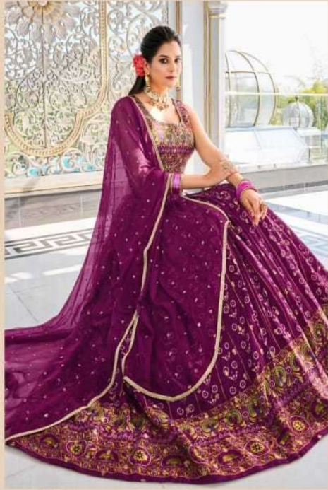
For elegance and class