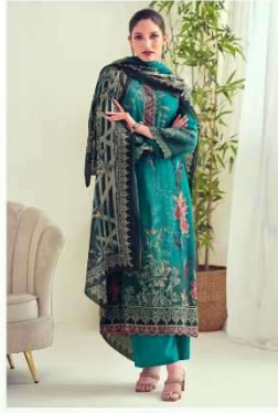
LOOK | 1504