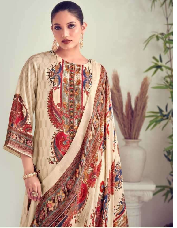
LOOK | 1505

STIMAR® S. BORGOMINI Via S. Felice 10, 20122 Milano, Italy