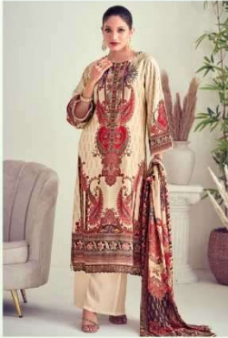
LOOK | 1505