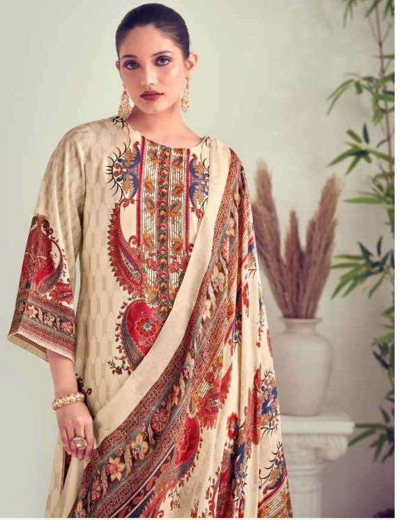
LOOK | 1505