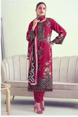
LOOK | 1503