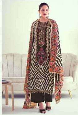
LOOK | 1506