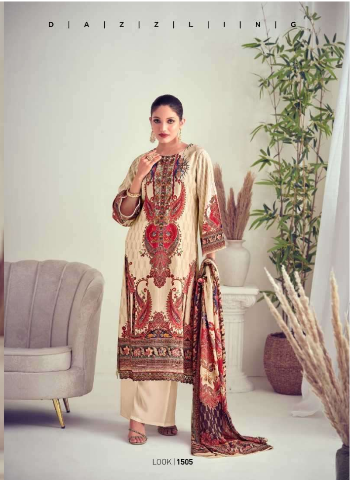
LOOK | 1505