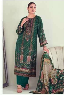
LOOK | 1508