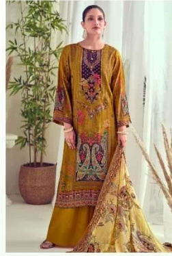
LOOK | 1507