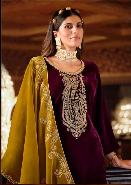
SHAHI ANDAAZ _ 839-002