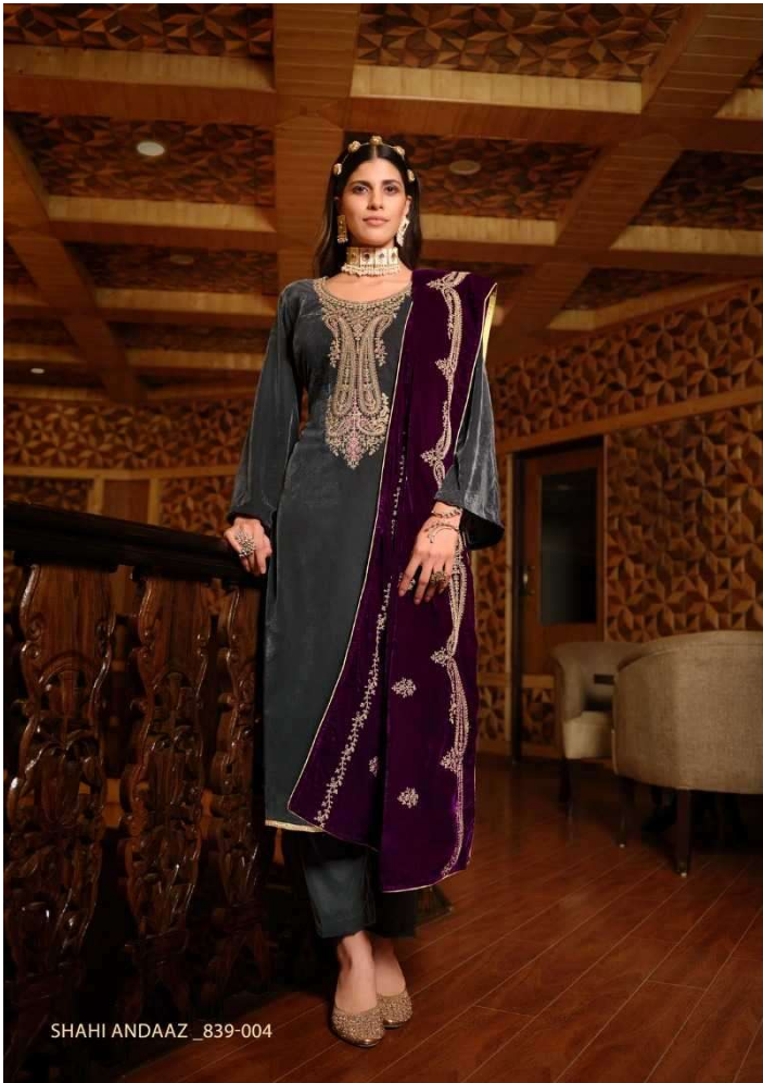
SHAHI ANDAAZ _ 839-004