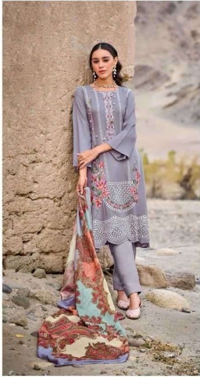
Fashion is what you're offered four times a year by designers. And style is what you choose.