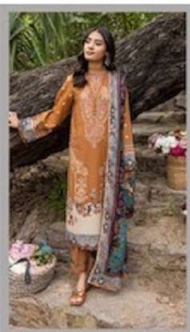
D. NO - 10005