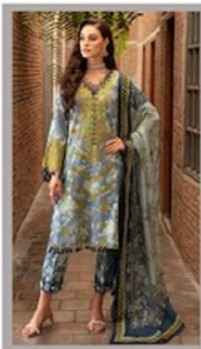
D. NO - 10003