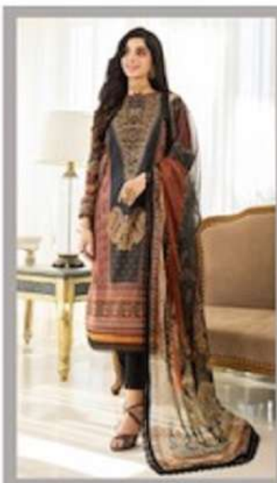
D. NO - 10006