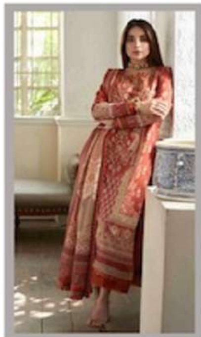
D. NO - 10001