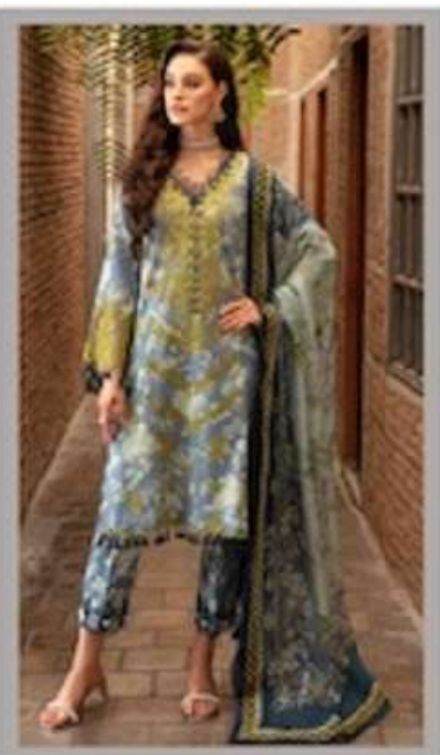
D. NO - 10003