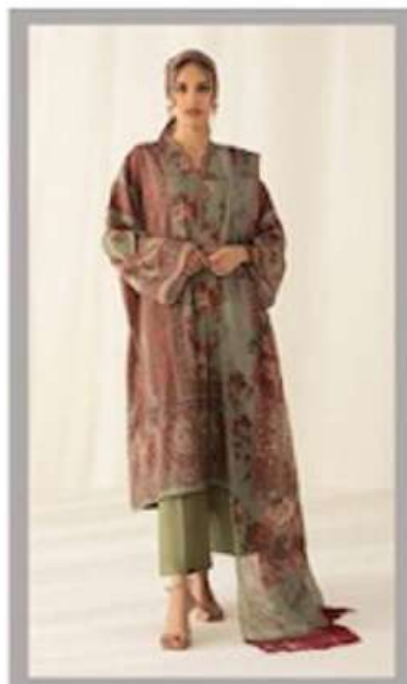
D. NO - 10004