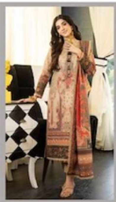
D. NO - 10002