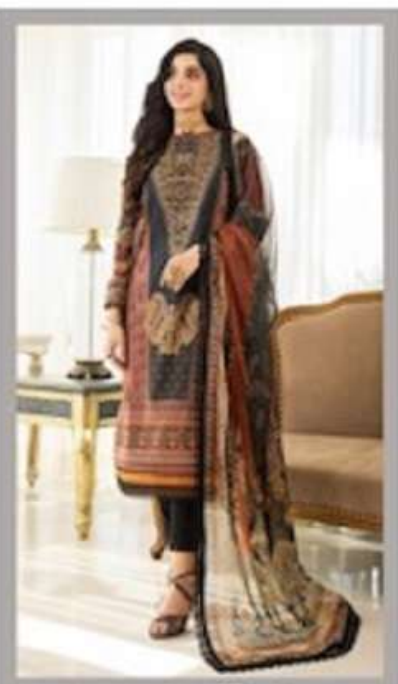
D. NO - 10006