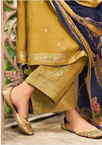
— MAGNET Saga