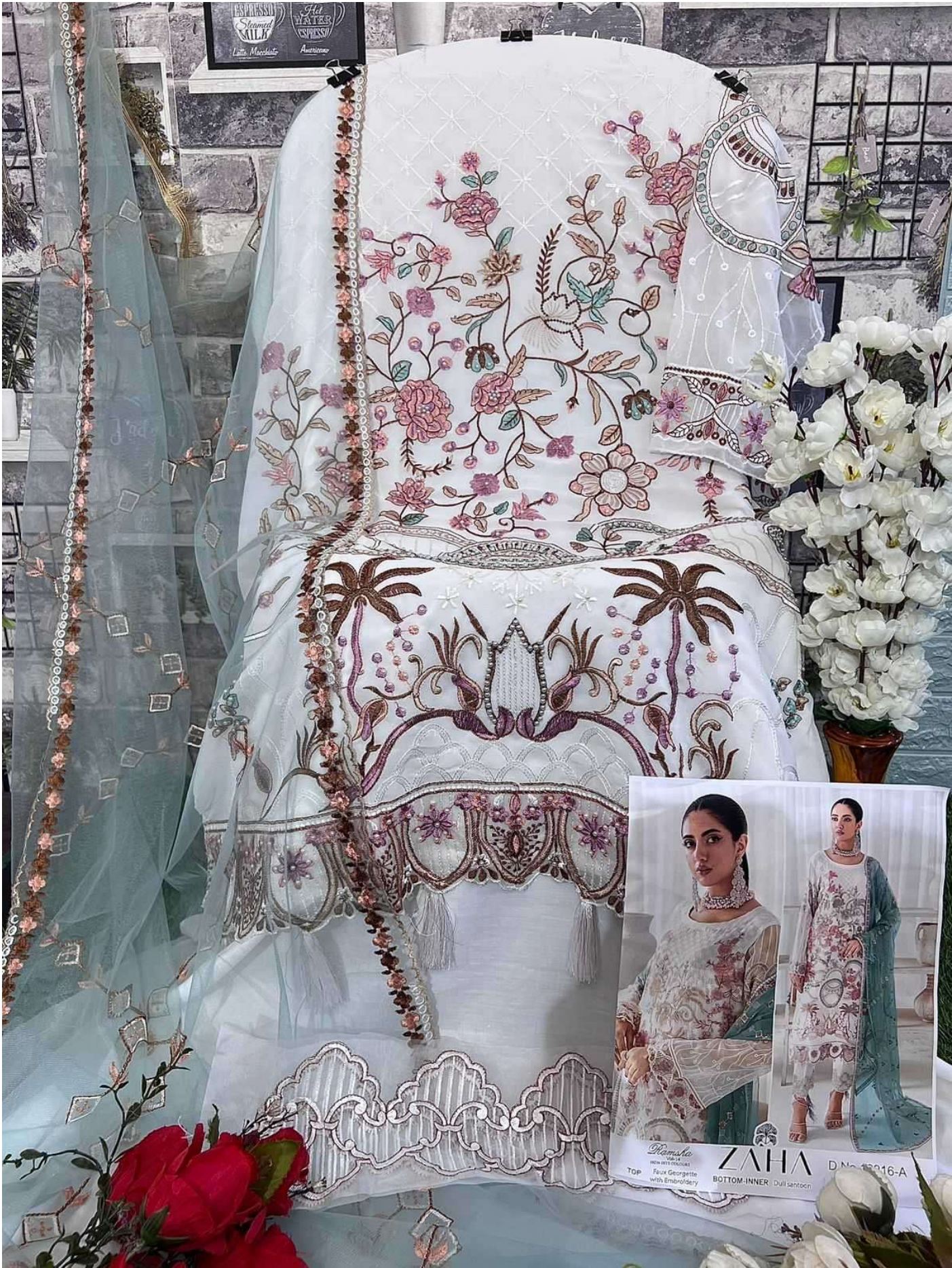
Hamisla 100% Silk NEW WITH TRENCH TOP: Faux Georgette with Embroidery BOTTOM-INNER: Dull santoon ZAHA D No. 12216-A