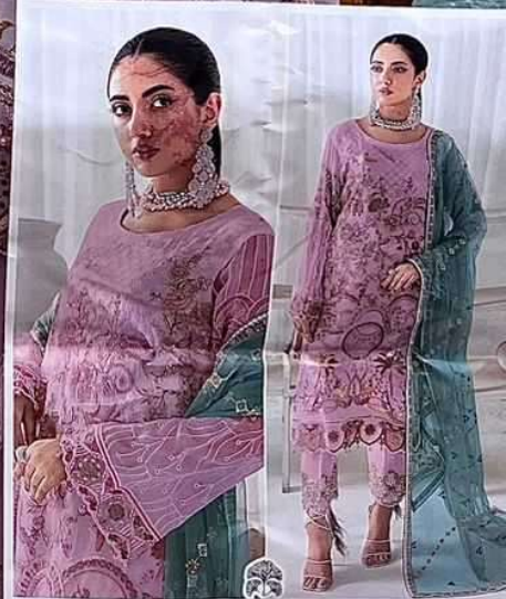
Shamsha ZAHHA D.No.10216-B TOP: Raw Silk Georgette with Embroidery BOTTOM-INNER: Du. Satton DUPATTA