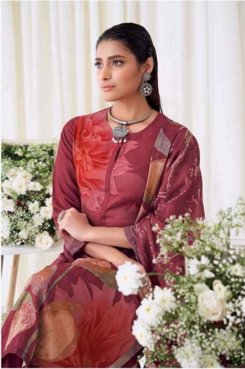
BLOTCHED FLORAL 1756