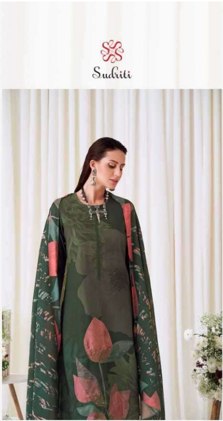
BLOTCHED FLORAL | 717