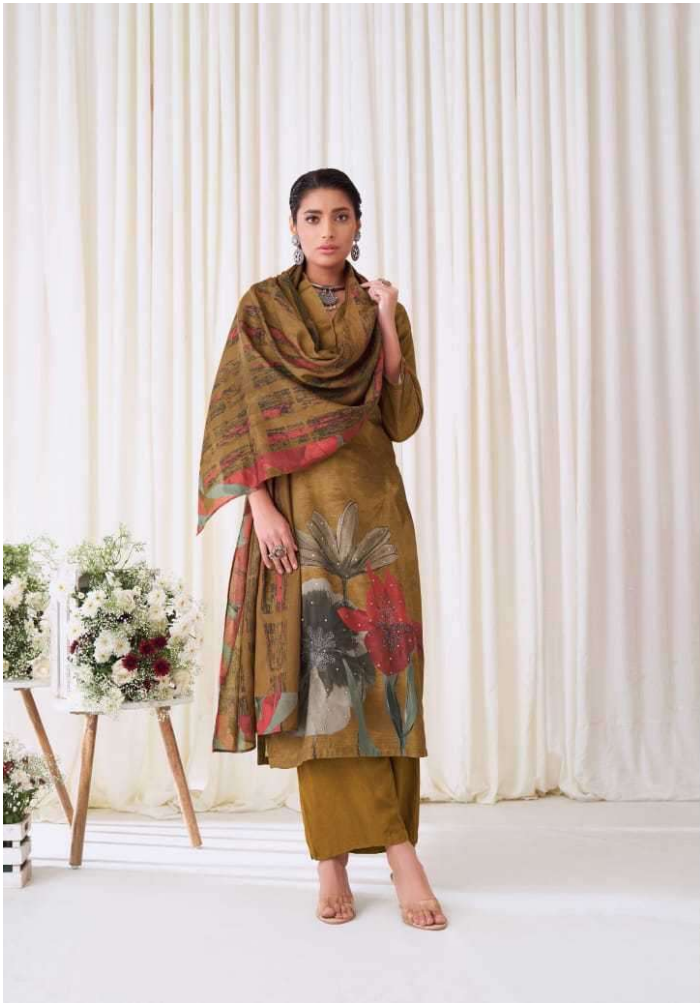
BLOTCHED | FLORAL 1734