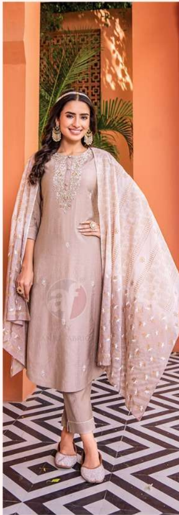
Once More 3245