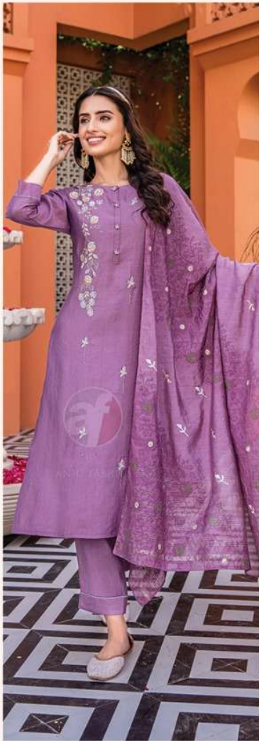
Once More 3241