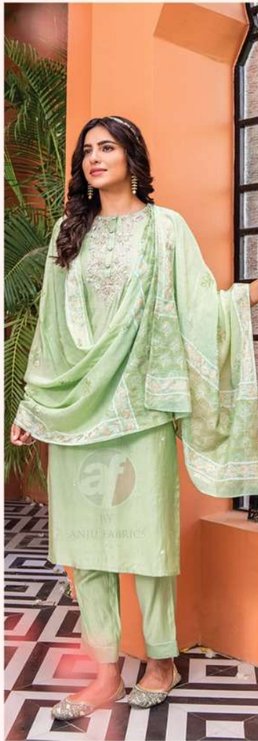
Once More 3242