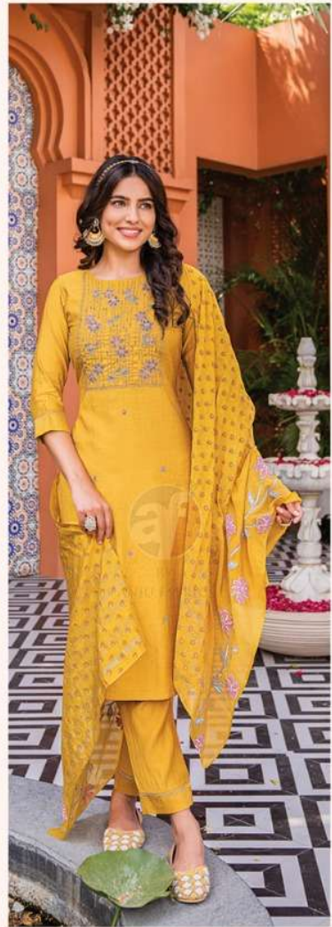
Once More 3246