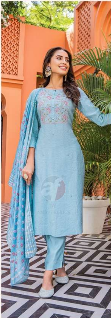
Once More 3244