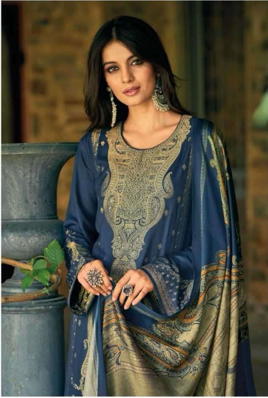
10451 || Remind yourself