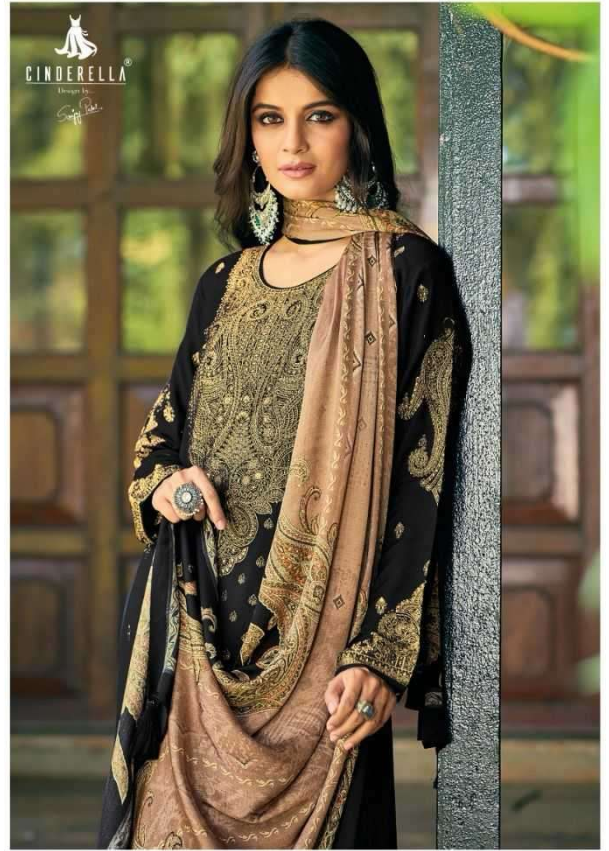
10450 || Remind yourself