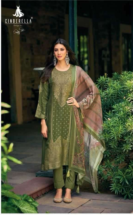
10454 || Remind yourself