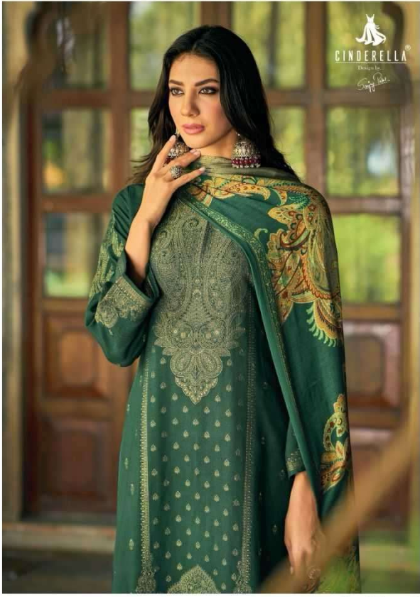
10448 || Remind yourself