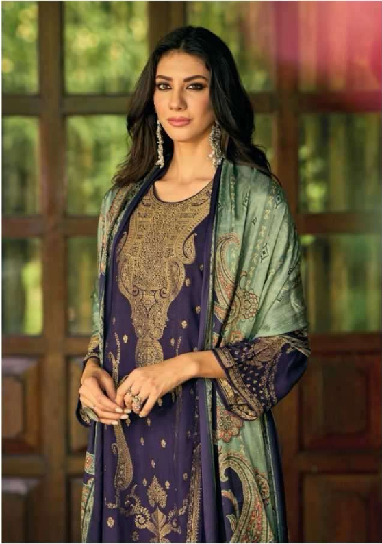
10449 || Remind yourself