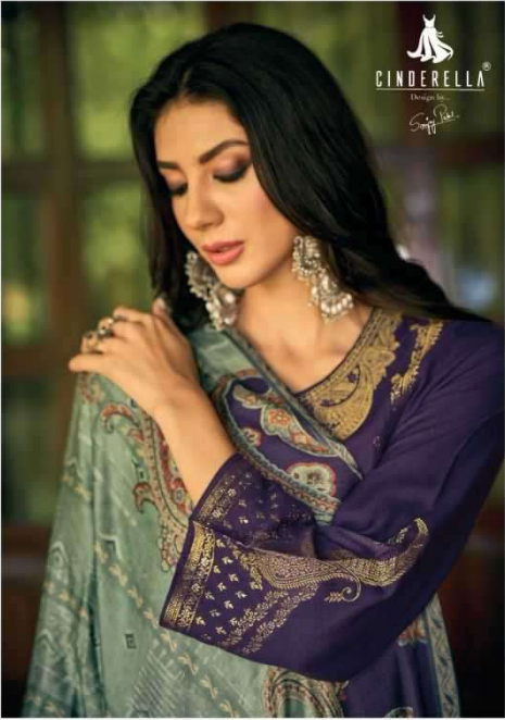
10449 || Remind yourself