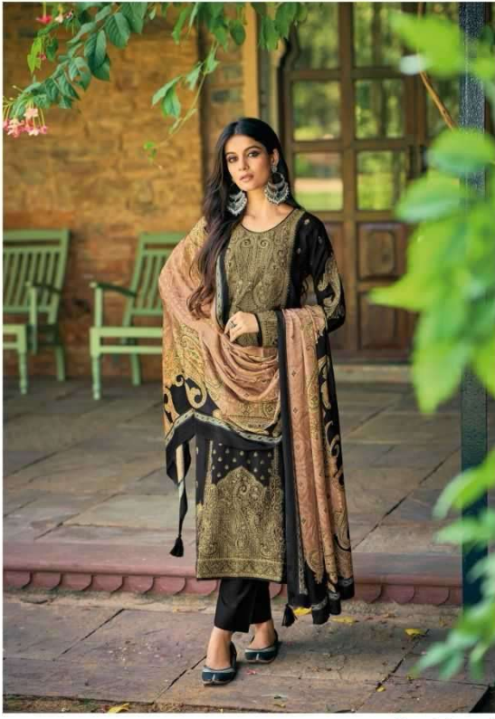
10450 || Remind yourself