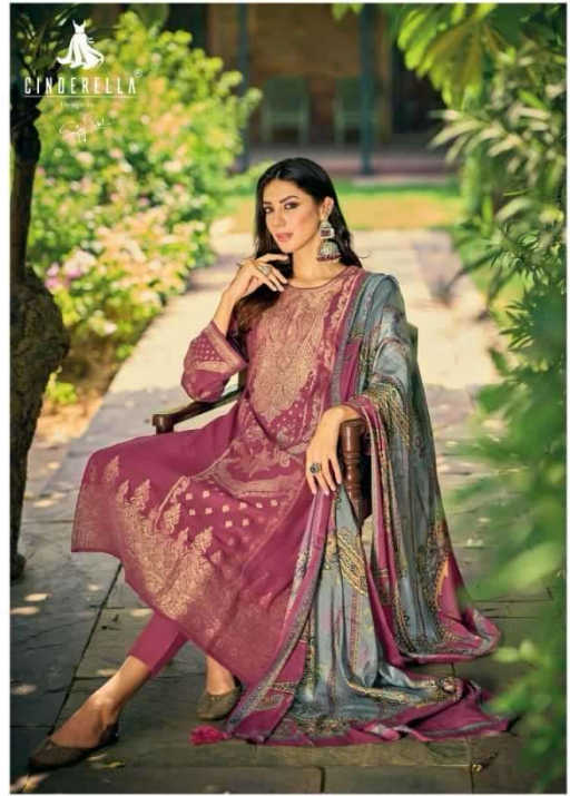
10452 || Remind yourself