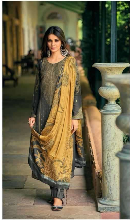
10453 | Remind yourself