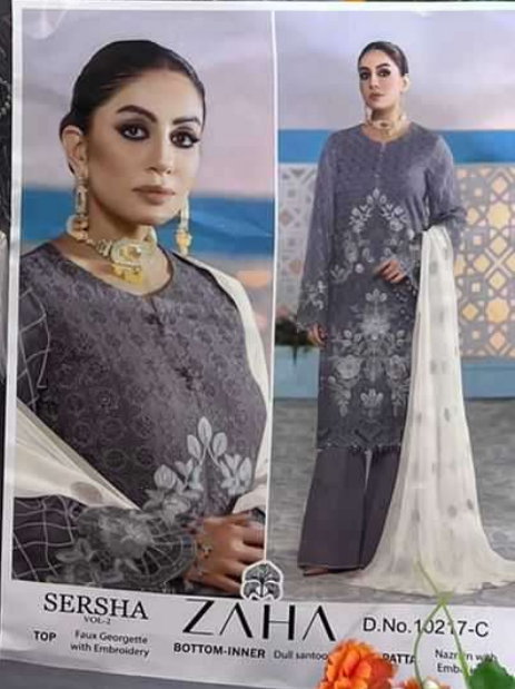
SERSHA VOL-2 TOP Faux Georgette with Embroidery ZAHA BOTTOM-INNER Dull santos D.No. 10217-C DATTI Nazim with Emb