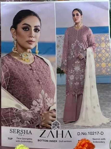
SERSHA D.No.10217-D TOP Faux Georgette with Embroidery ZAHA BOTTOM-INNER Dull sarisoon Nazmin with Embroidery