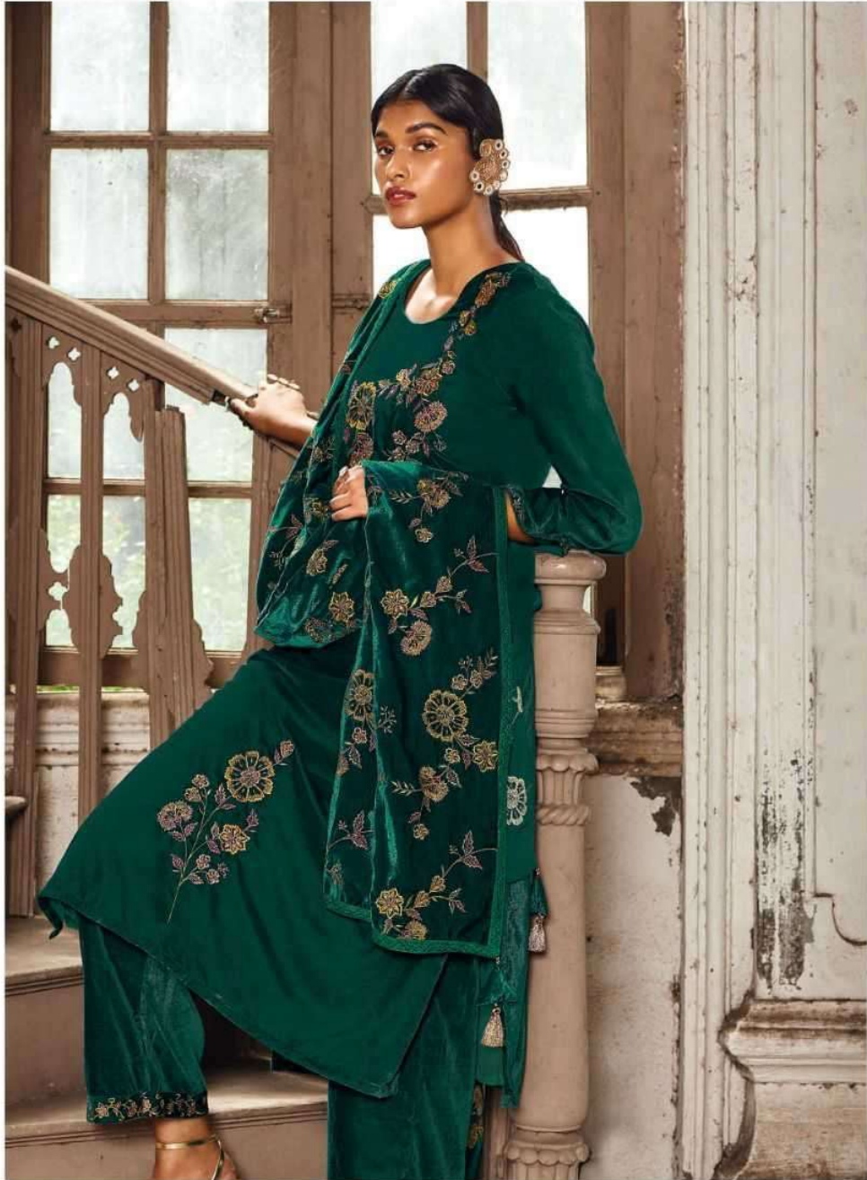
Ganga Fashions presents Samaa When you are in wait for someone special, standing in your balcony with a flower in hand makes you the best in this world. from top to down your combination with this lehnga is a beautiful day for someone.