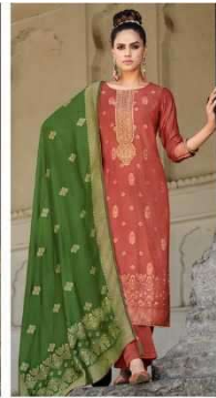
830-005 ■ ■ ■