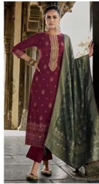
830-004 ■ ■ ■