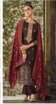
830-002 ■ ■ ■