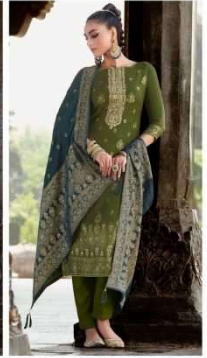
830-003 ■ ■ ■