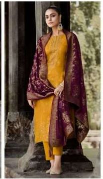
830-006 ■ ■ ■