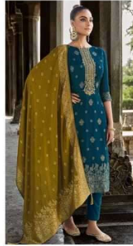
830-001 ■ ■ ■