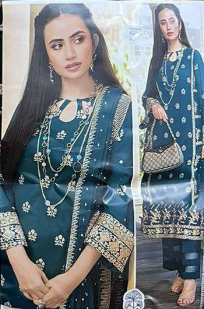
KHUSHBU Vol-7 ZAHA D.N TOP: Faux Georgette with Embroidery BOTTOM-INNER: Dull santoon DUPA