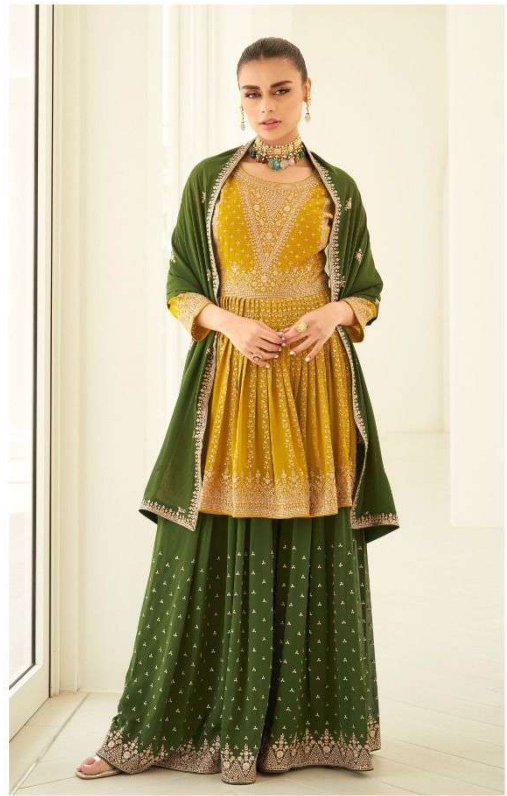
A | - 9661