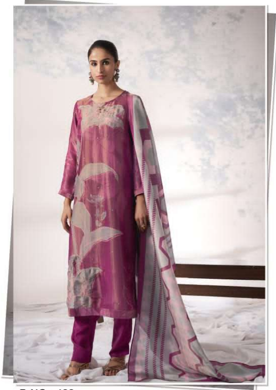
D.NO : 430