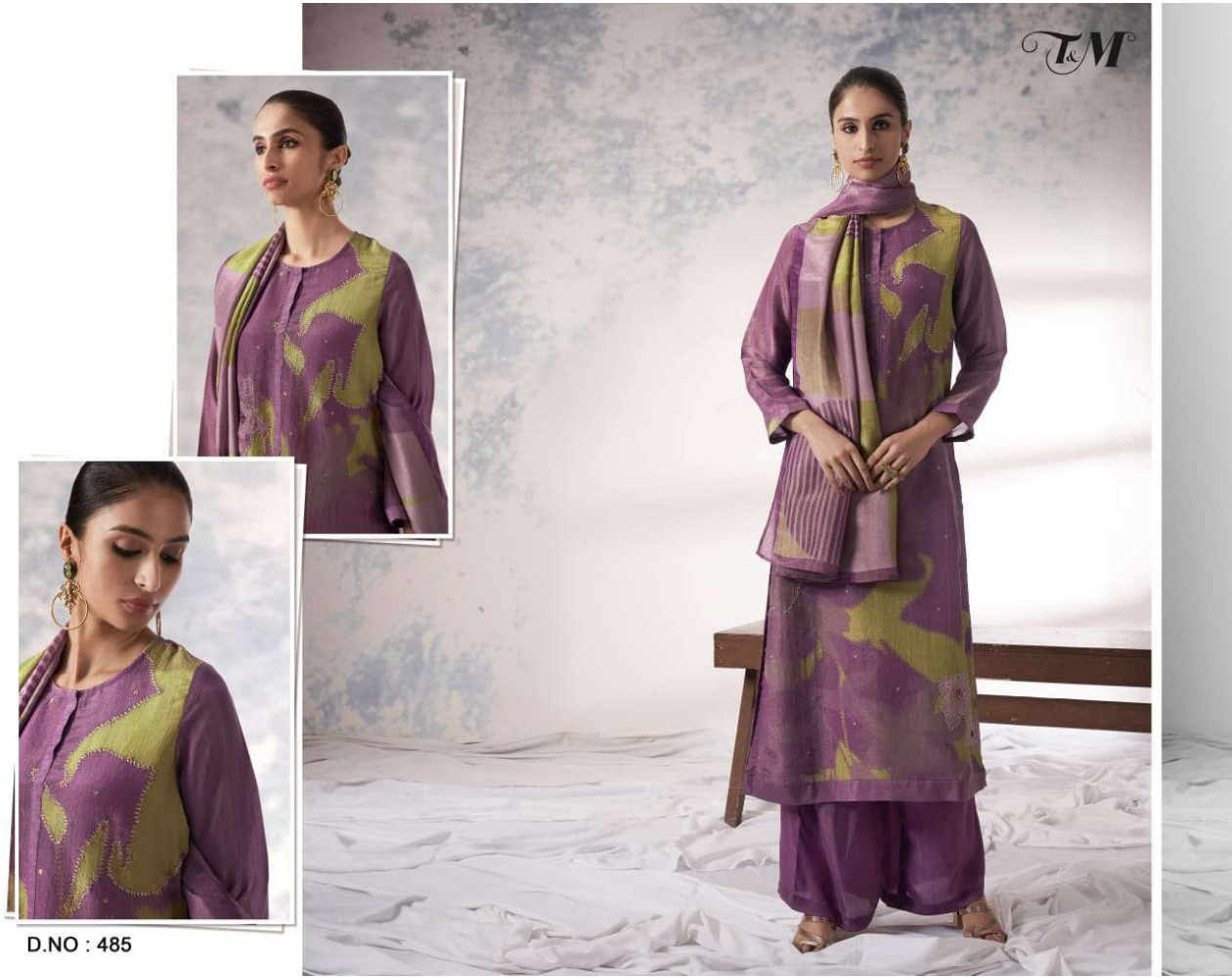
D.NO : 485