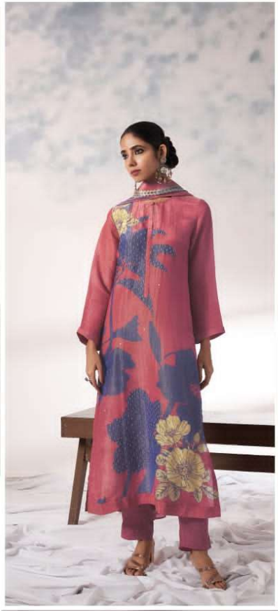
D.NO : 428