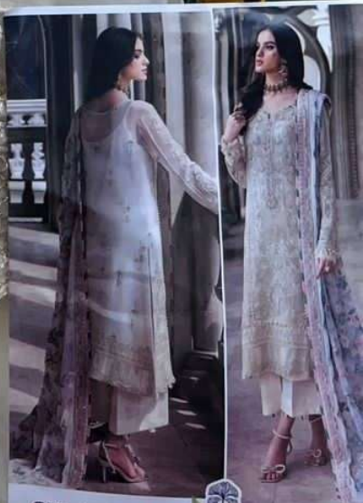
GULAAL VOL-1 TOP Faux Georgette with Embroidery SHA D.No. 11 DUPATTA