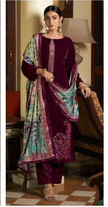
▪ 185 006 ▪