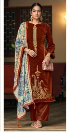
▪ 185 003 ▪