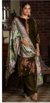
▪ 185 005 ▪