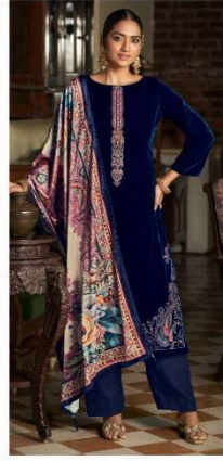
▪ 185 002 ▪