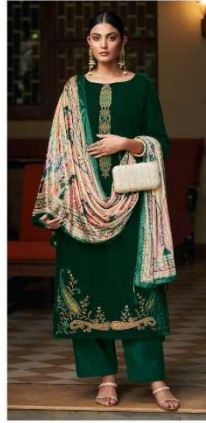
▪ 185 004 ▪