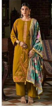
▪ 185 001 ▪