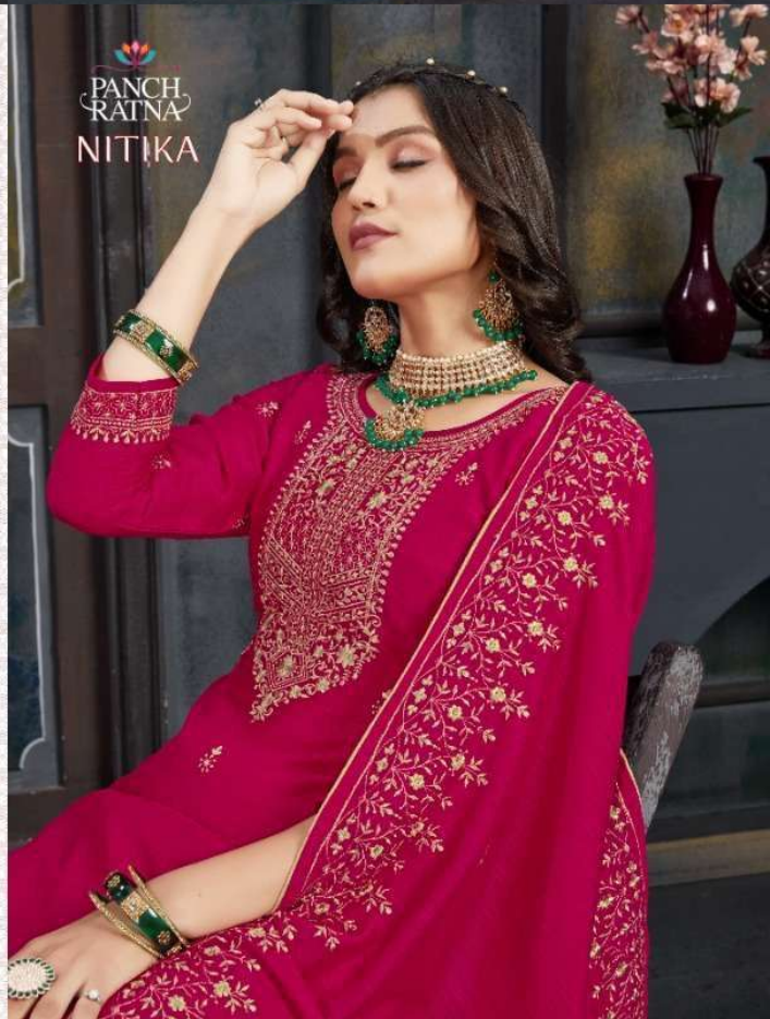
TOP: PATTERN SILK HEAVY EMBROIDERY SLIVE WORK DUPATTA: PATTERN SILK HEAVY EMBROIDERY WORK BORDER BOTTOM+INNER: CRAPE SILK