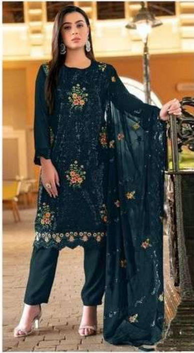
D.NO. - 14001