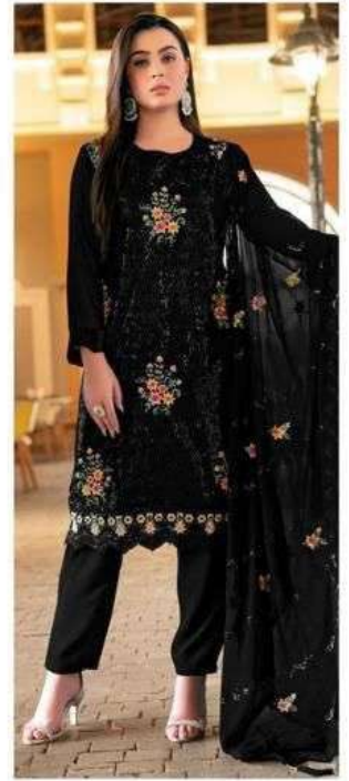
D.NO. - 14003