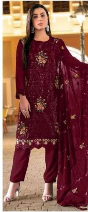
D.NO. - 14002