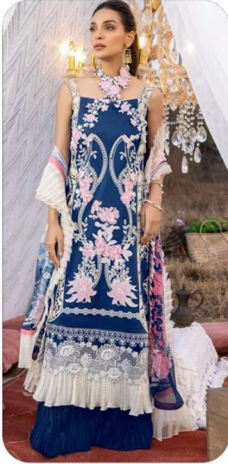
D.No | 224 A