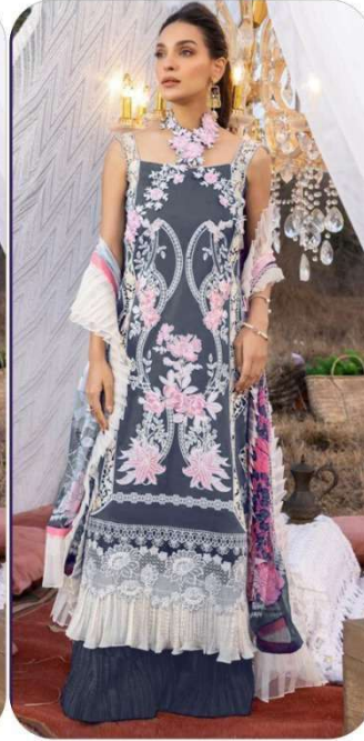
D.No | 224-C