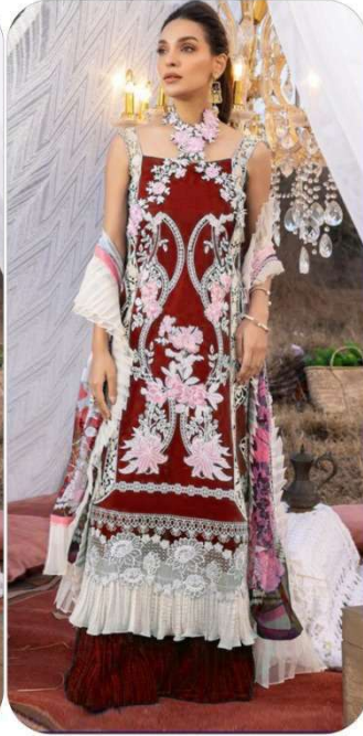
D.No | 224-B