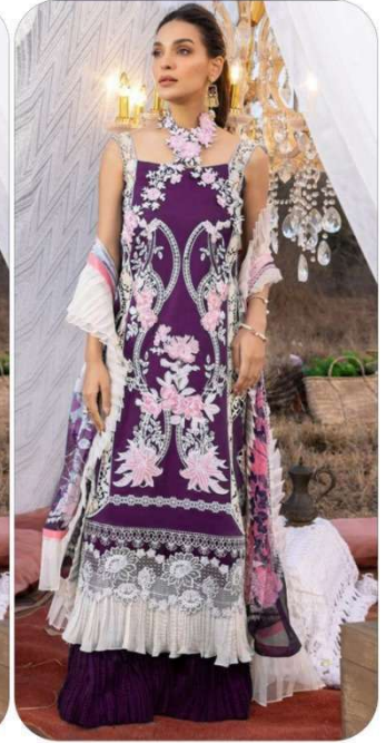
D.No | 224-D