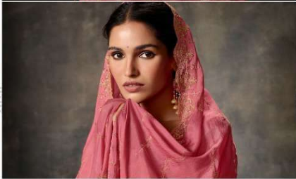
The art of being graceful D.NO.14872