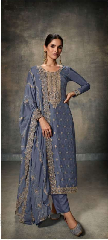
Brighten up your festive mood D.NO.14873