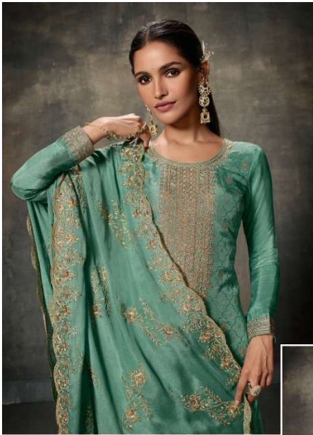
Embrace elegance and poise. D.NO. 14871