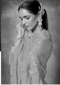
Get ready for summer festivities.