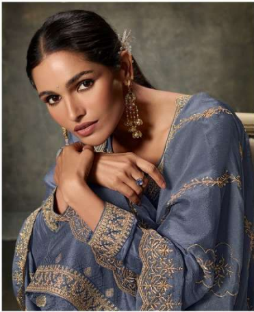
Brighten up your festive mood D.NO.14873