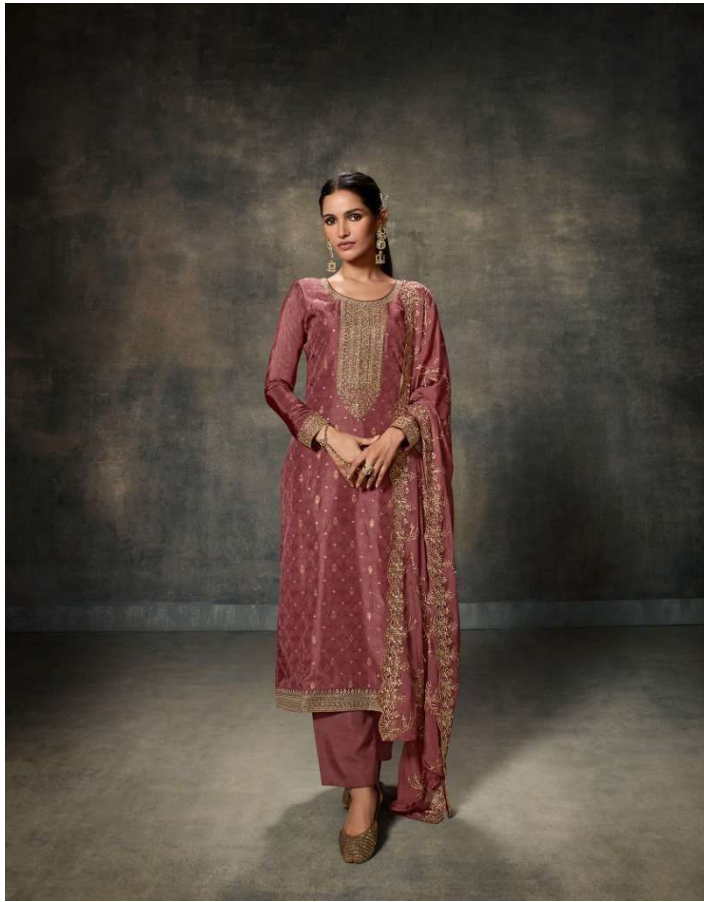
Set your own fashion goals D.NO. 14875