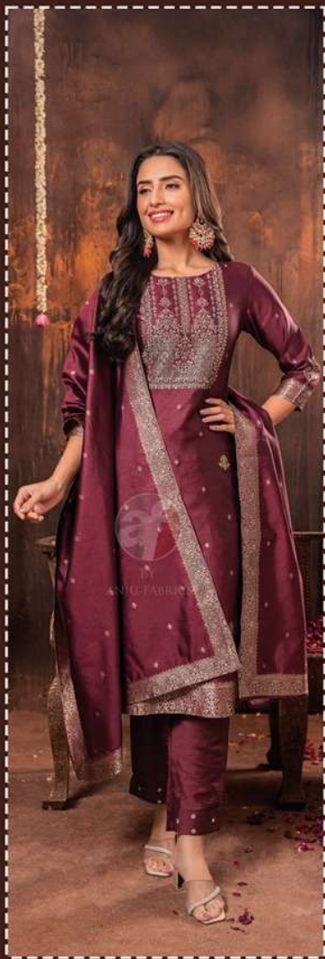
Sell AFFAIR 3211