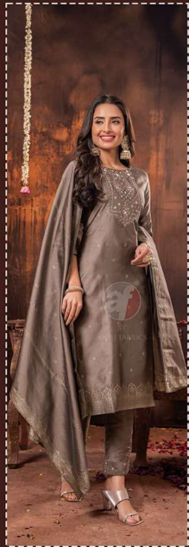
Sell AFFAIR 3216