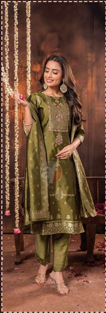
Sell AFFAIR 3214