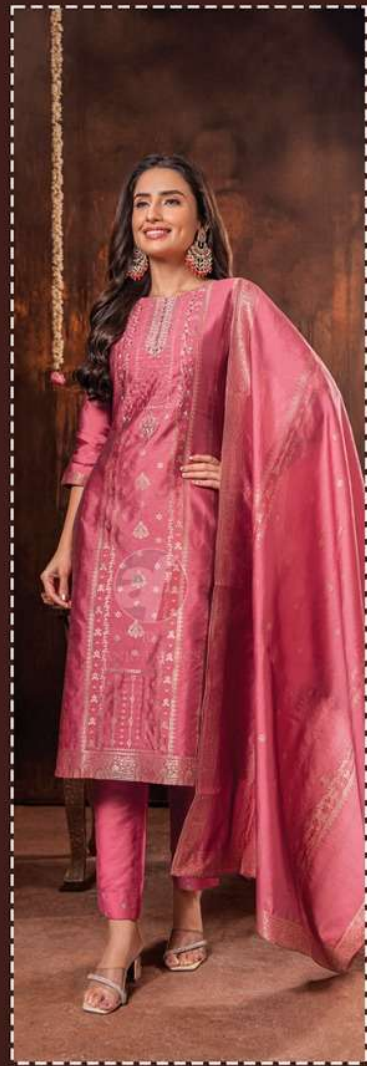
Sell AFFAIR 3213