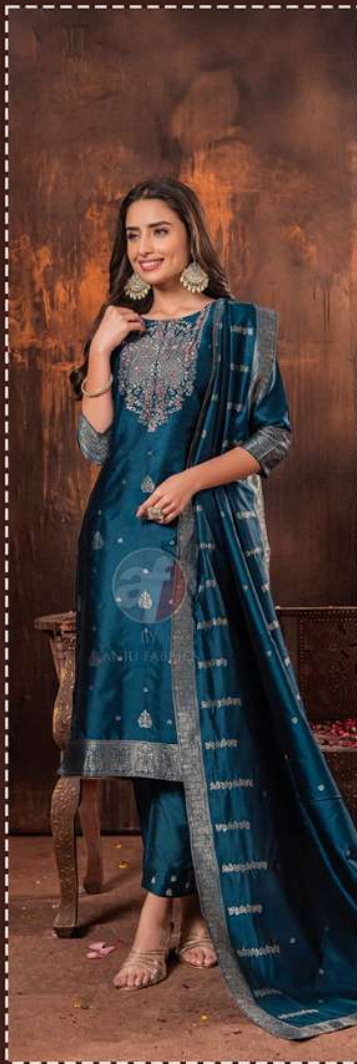
Sell AFFAIR 3215