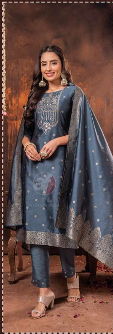
Sell AFFAIR 3212