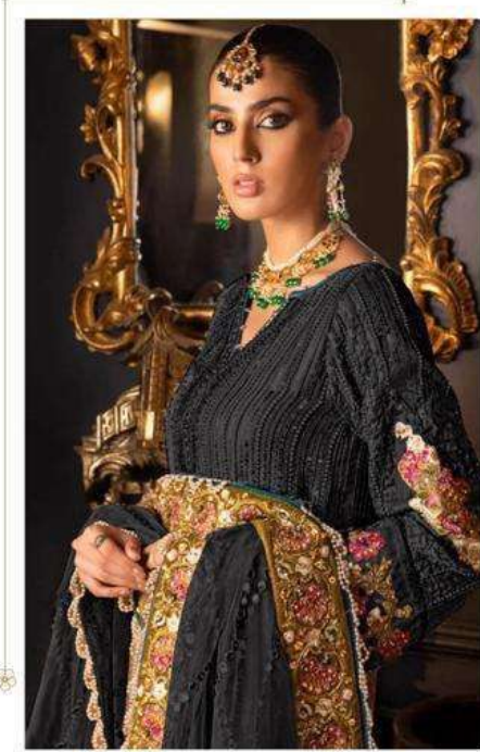
EMAAN ADEEL PREMIUM COLLECTION VOL-13