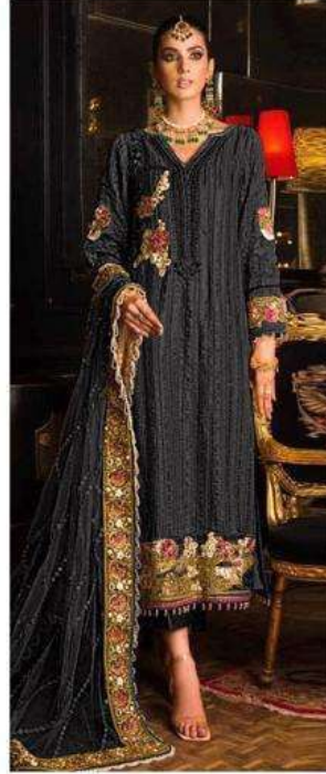
D.NO. - 13001