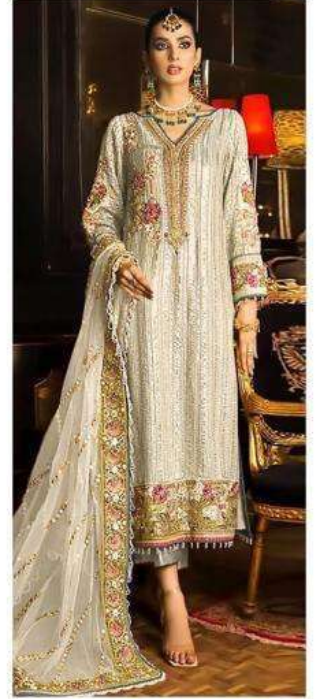
D.NO. - 13002