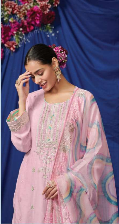
JUGMUG • 8994