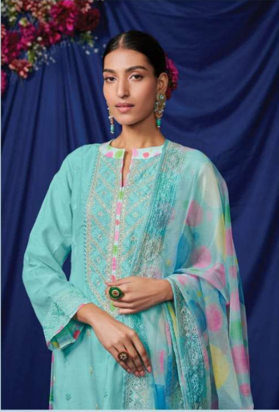
JUGMUG · 8993