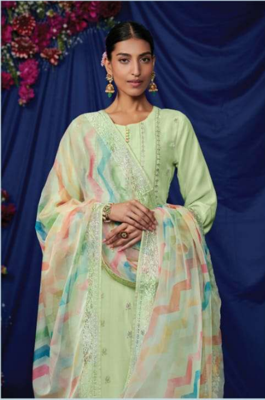
JUGMUG - 8991