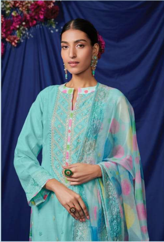
JUGMUG · 8993