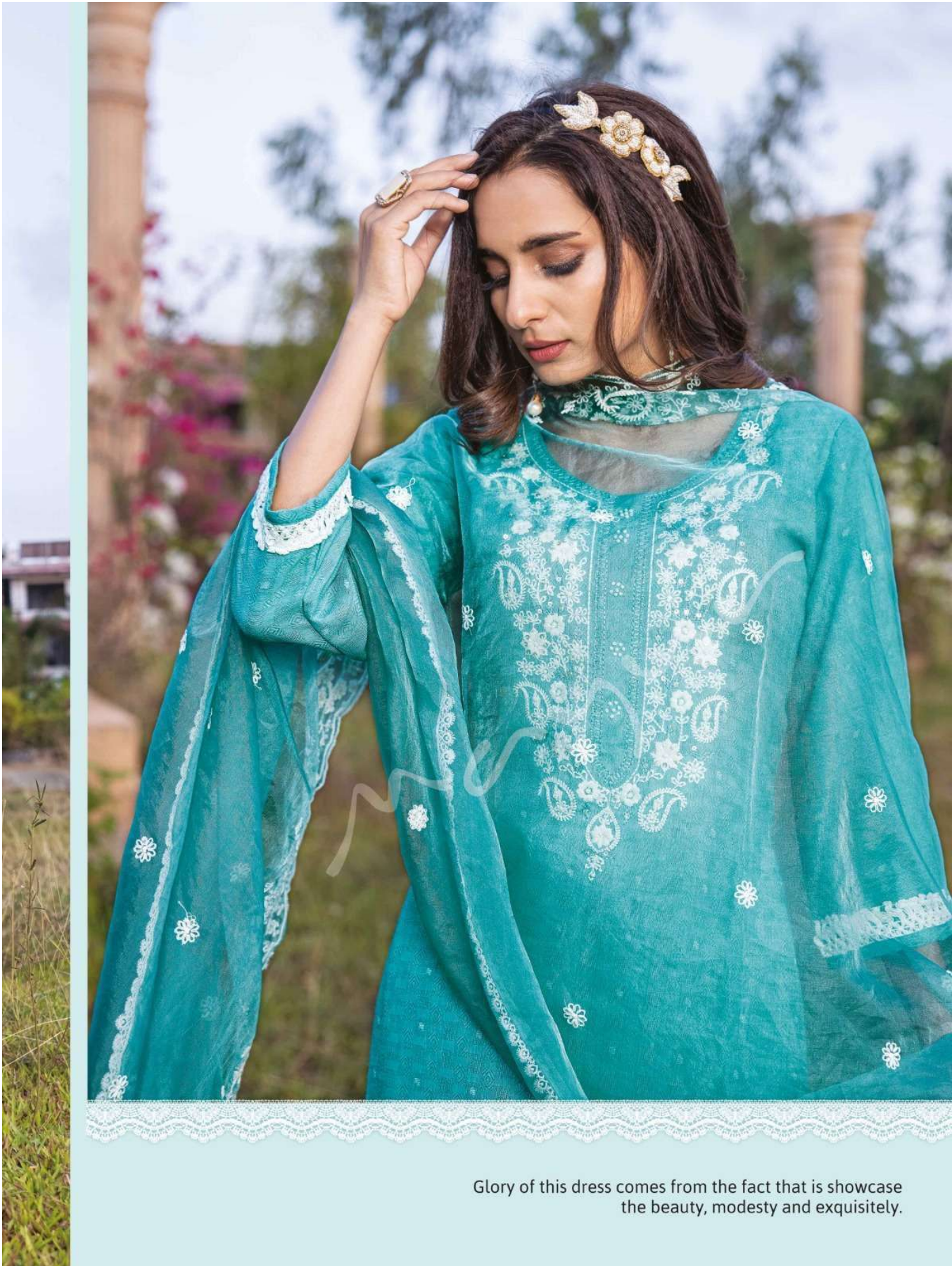
Glory of this dress comes from the fact that it showcases the beauty, modesty and exquisitely.