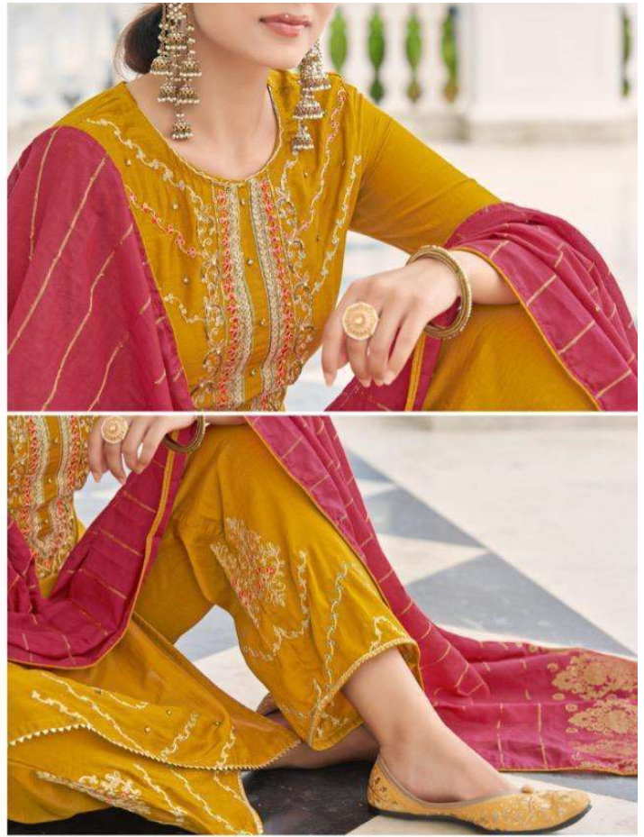
Evoke your ethnic ethos with this beautifully crafted dress with embroidery details. 02