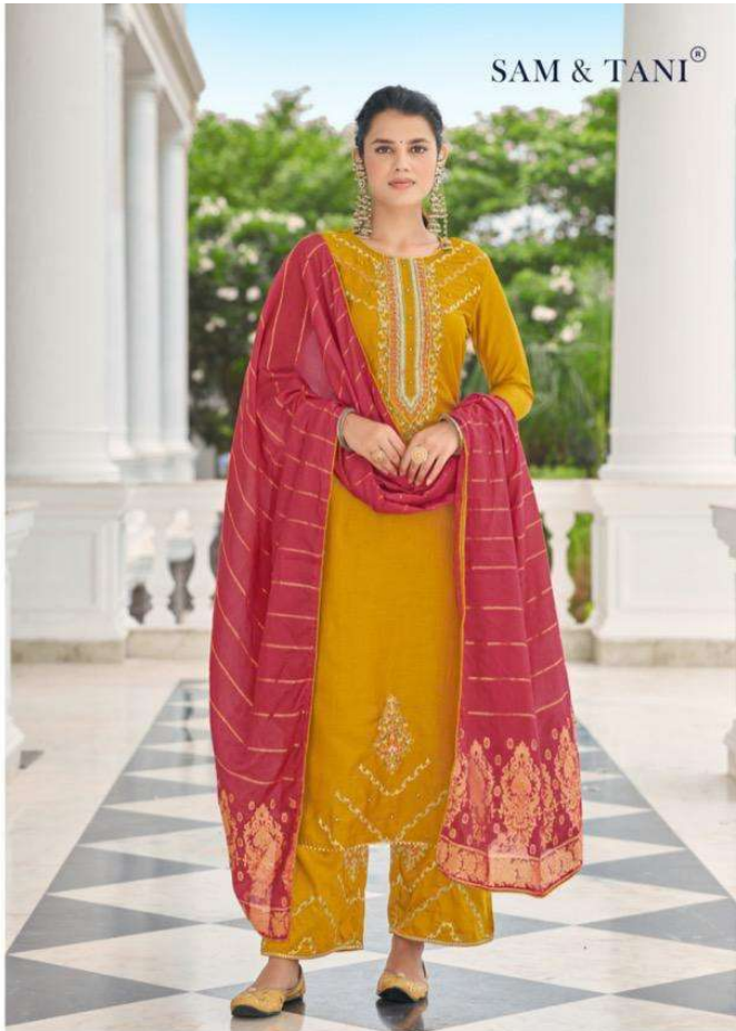
Evoke your ethnic ethos with this beautifully crafted dress with embroidery details. 02