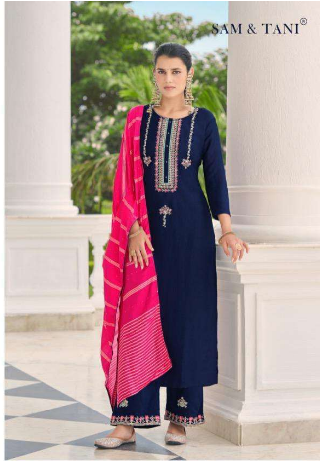
Redefine your style with latest trends to get a mesmerizing look when you head to a special occasion.