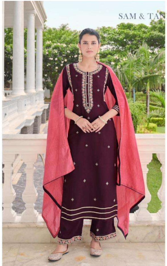
brings to you elegant & unique effortless style that perfectly blends with the trends of the season.