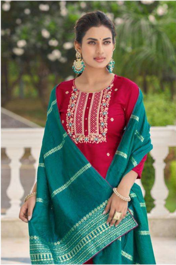
Embrace the grace this season while you adorn this spectacular piece from the collection. 01