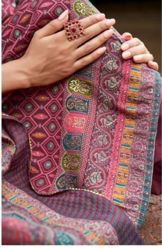
EACH ESSENCE TELLS A STORY OF THE HERITAGE LEGACY OF OUR COUNTRY