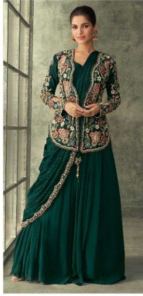
D NO: 5250