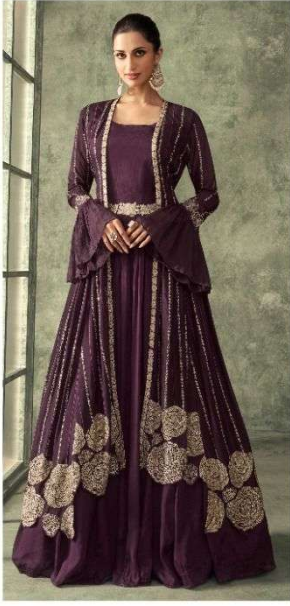
D NO: 5249