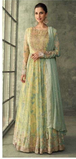
D NO: 5251