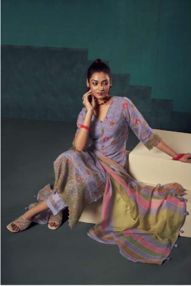
Splendid motifs and grandeur appeal make this edit of saris awe-worthy. Get all the ethereal and earthy looks here.