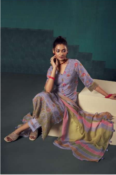
Splendid motifs and grandeur appeal make this edit of saris awe-worthy. Get all the ethereal and earthy looks here.