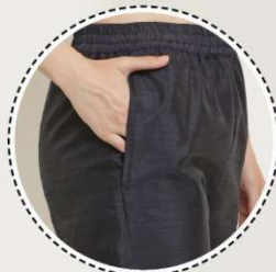
Single Side Pocket