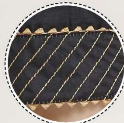
Gota Zari Work

LATEST FASHION • HI-QUALITY • LOWEST PRICE