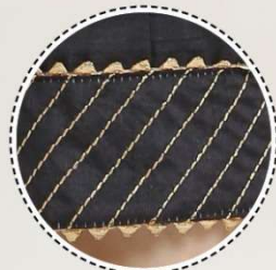
Gota Zari Work