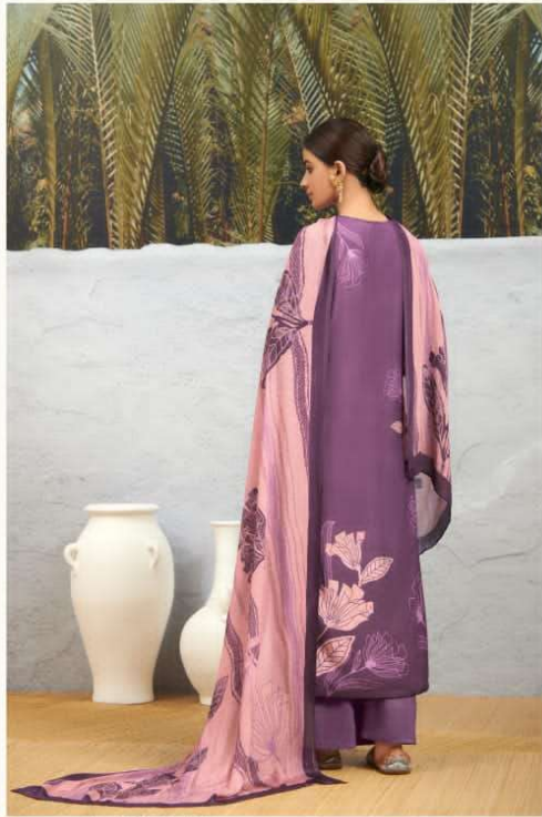
• 512 • MAHI