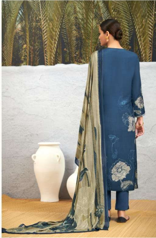
• 556 • MAHI