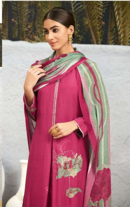
• 524 • MAHI