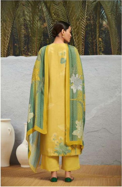
• 536 • MAHI