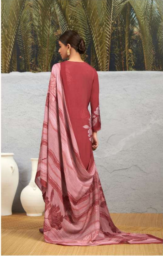
• 518 • MAHI