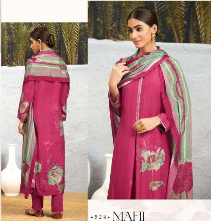
• 524 • MAHI