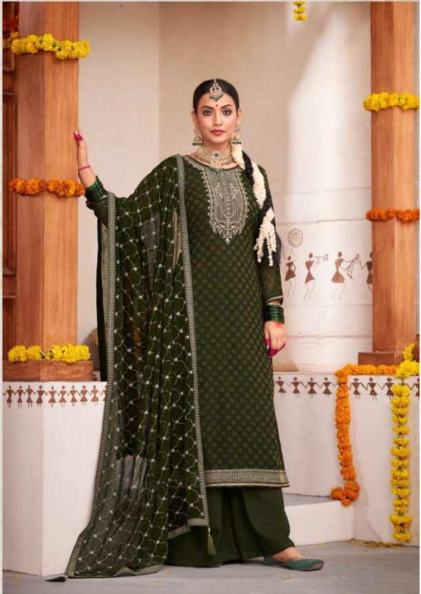
Culture is just another accessory for someone with great style ...