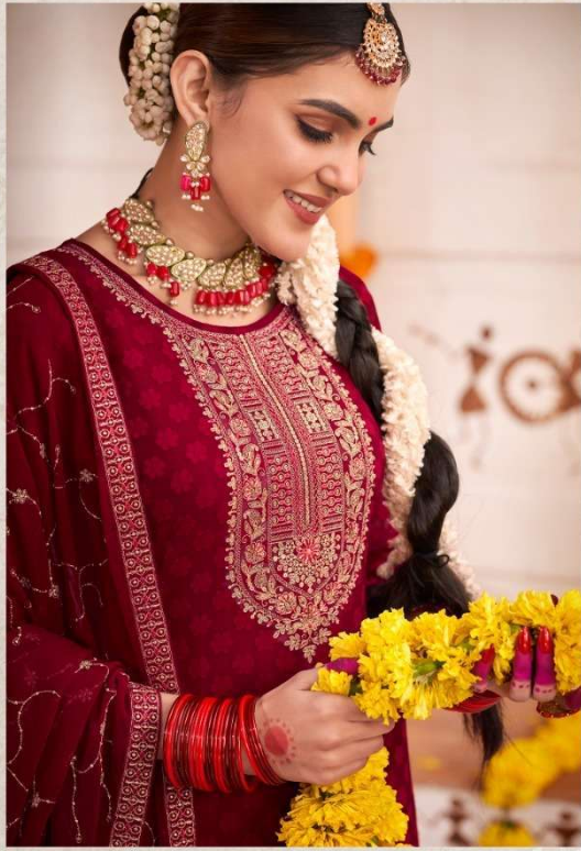
Fashion is the armor with which to survive the reality everyday life ...