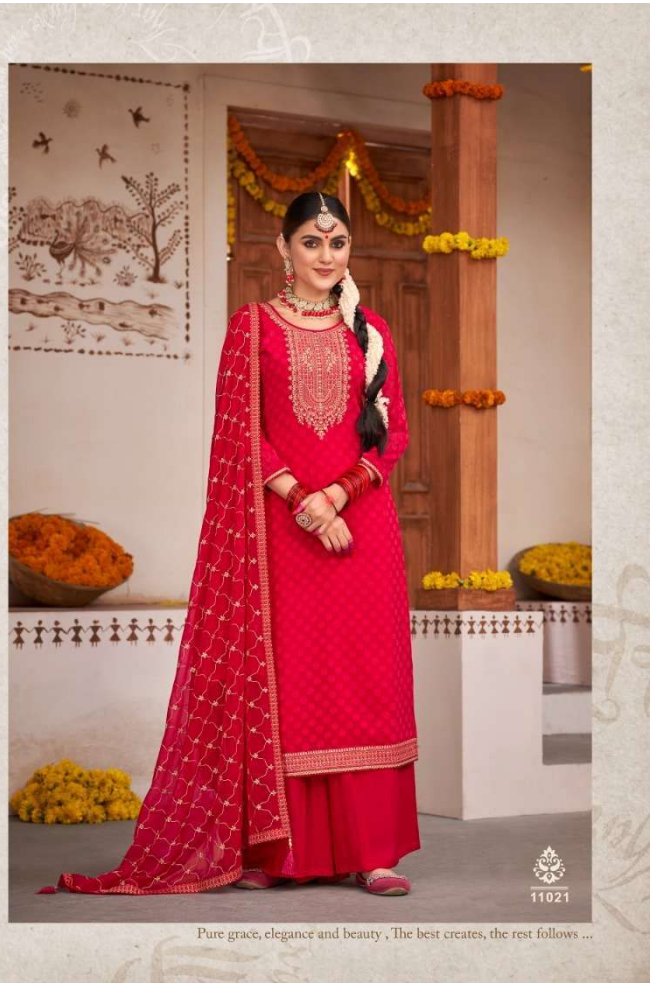
Pure grace, elegance and beauty, The best creates, the rest follows ...