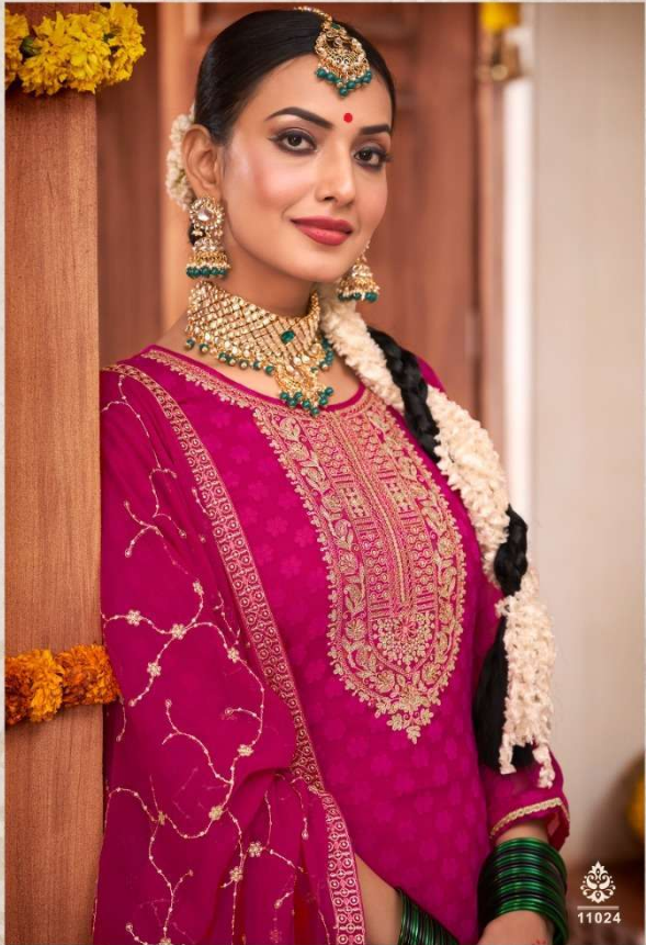
Fashion is a language which tells a story about the person who wears it ...